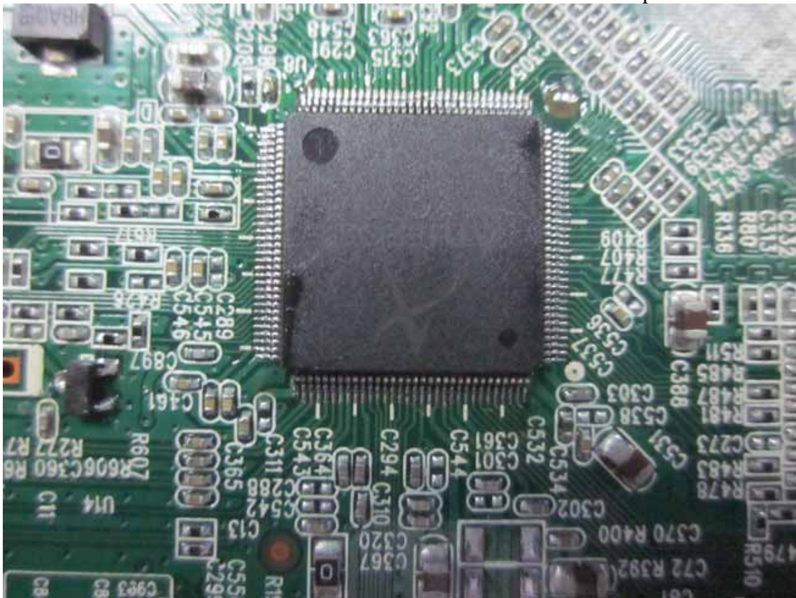
Figure 13 Component side of the PCB