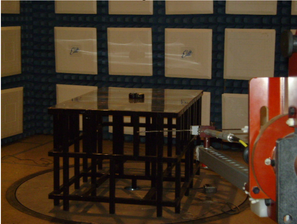
Test Setup for Radiated Emissions – 315MHz, horizontal polarization