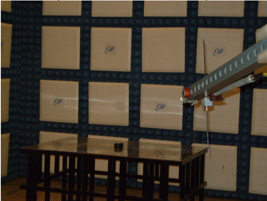
Test Setup for Radiated Emissions – 315MHz, vertical polarization