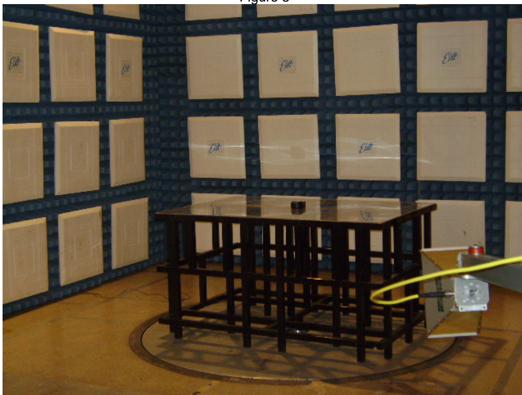
Test Setup for Radiated Emissions – 1GHz to 4GHz, horizontal polarization