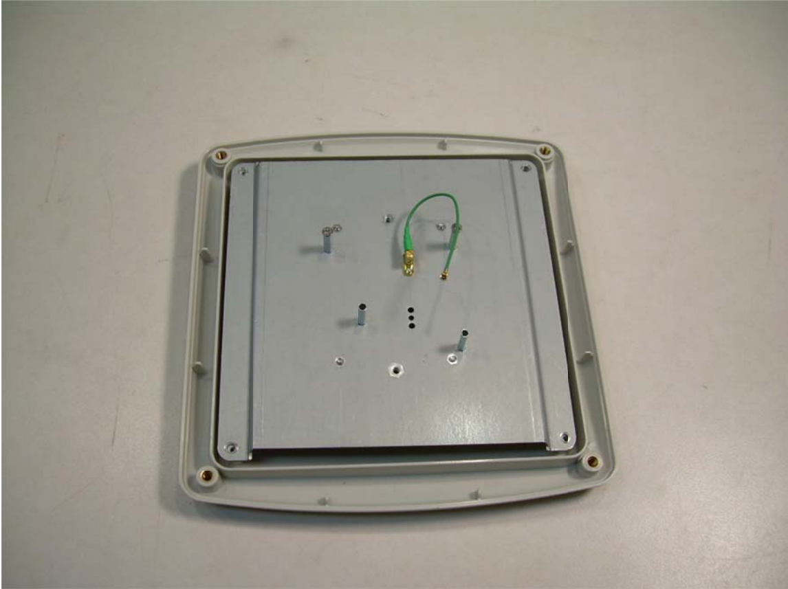
Rear Cover Removed Showing Antenna Mounting and Coax