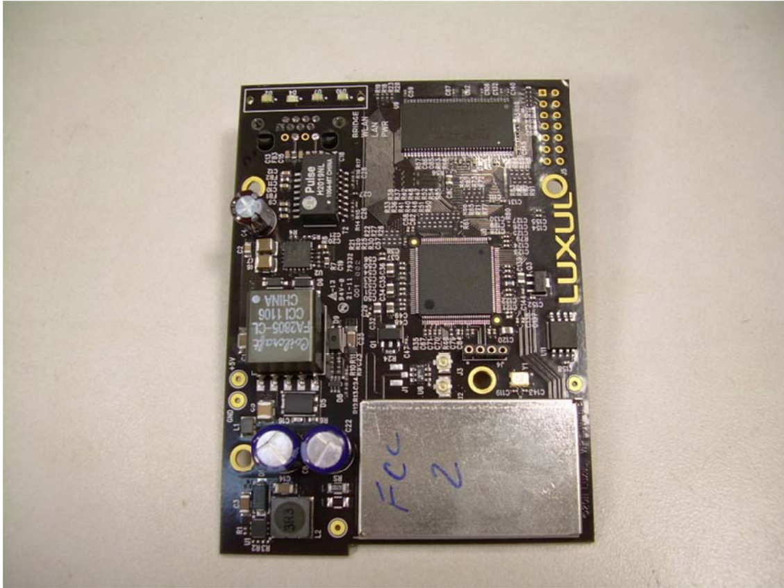
View of the Component Side of the PCB with RF Shielding in Place