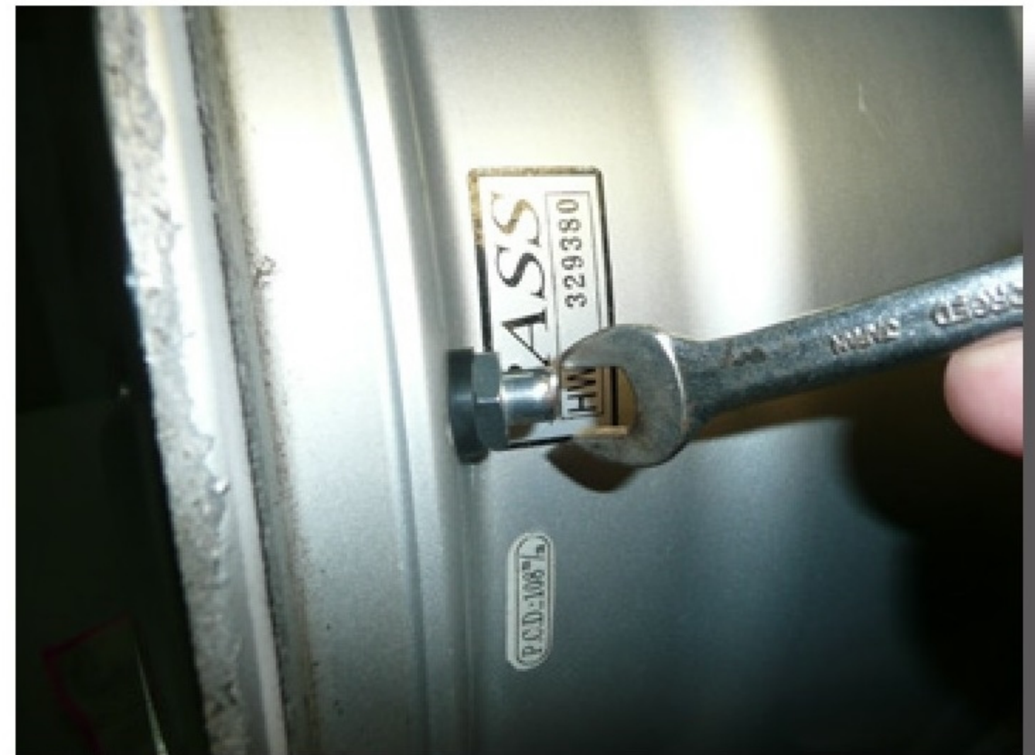
Use wrench to hold valve stem and keep vertical while