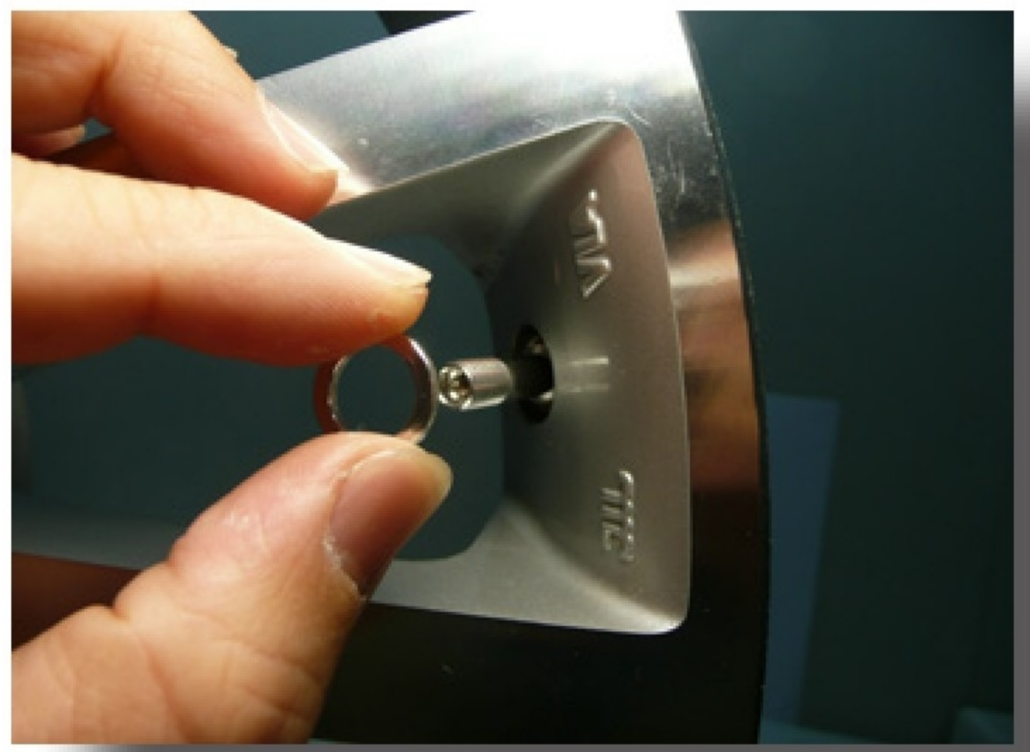
Put on washer