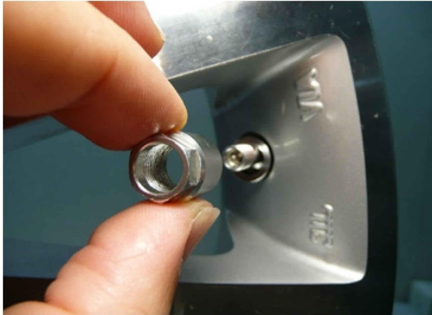
Install hexagonal nut into valve stem. Tighten the nut