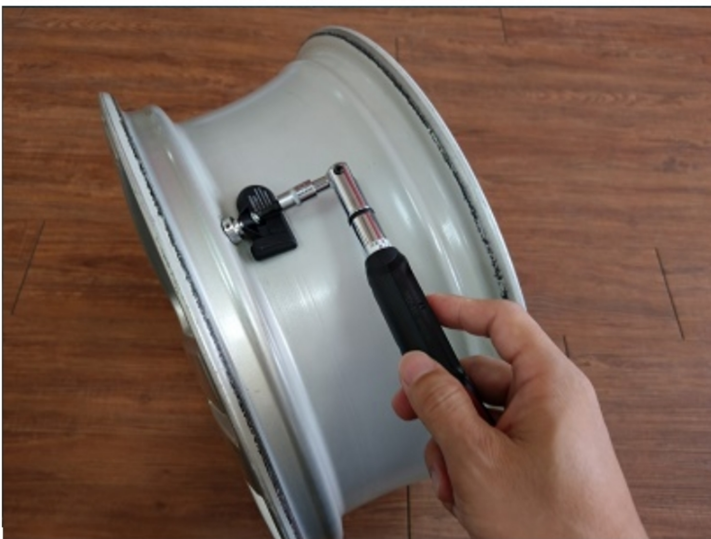
Install sensor. Adjust the sensor to fit the drop well of the wheel. Use wrench to keep stem vertical then tighten. Tighten the screw until 2.2Nm (Recommended Final Torque Setting)