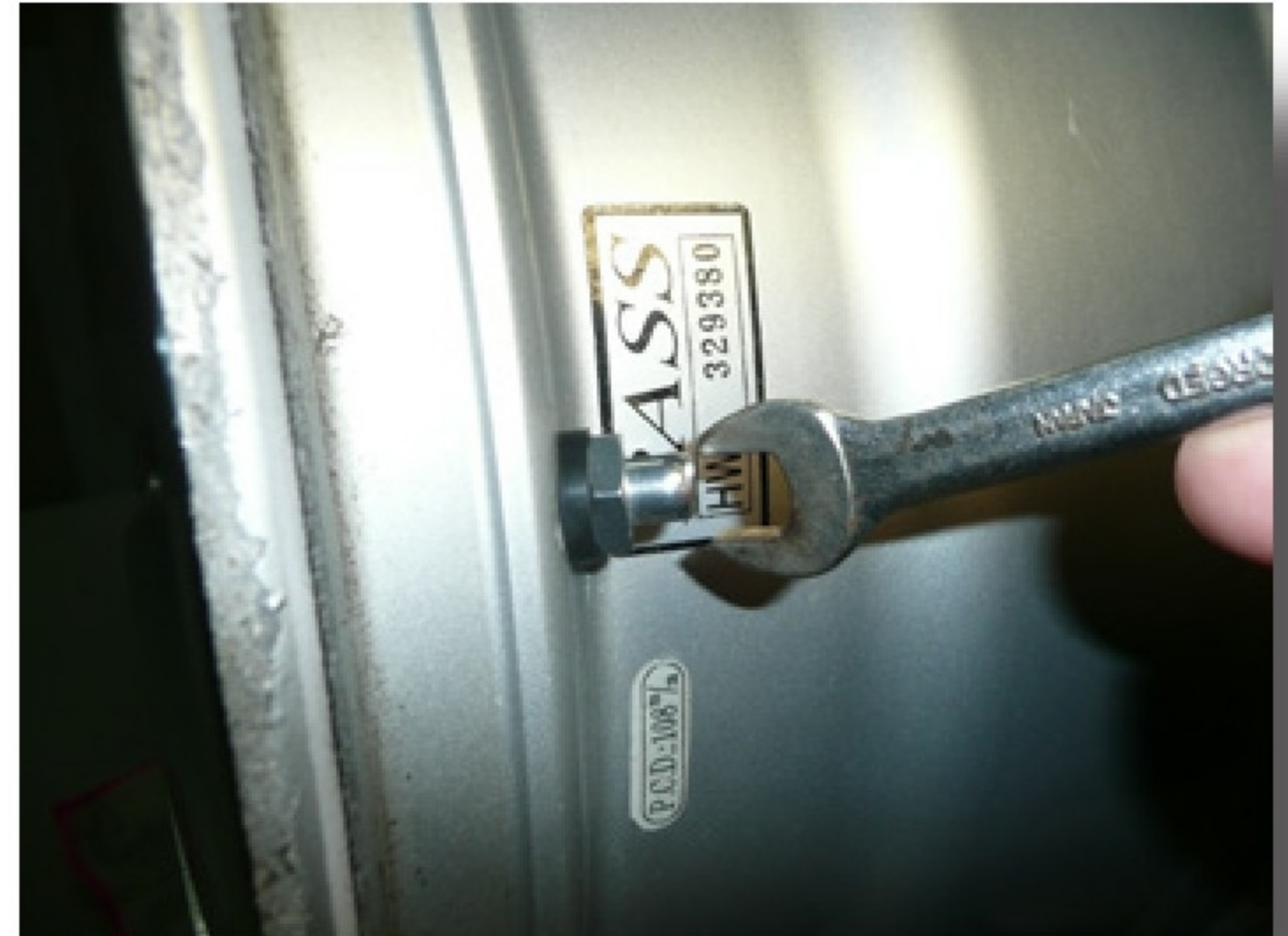
Use wrench to hold valve stem and keep vertical while