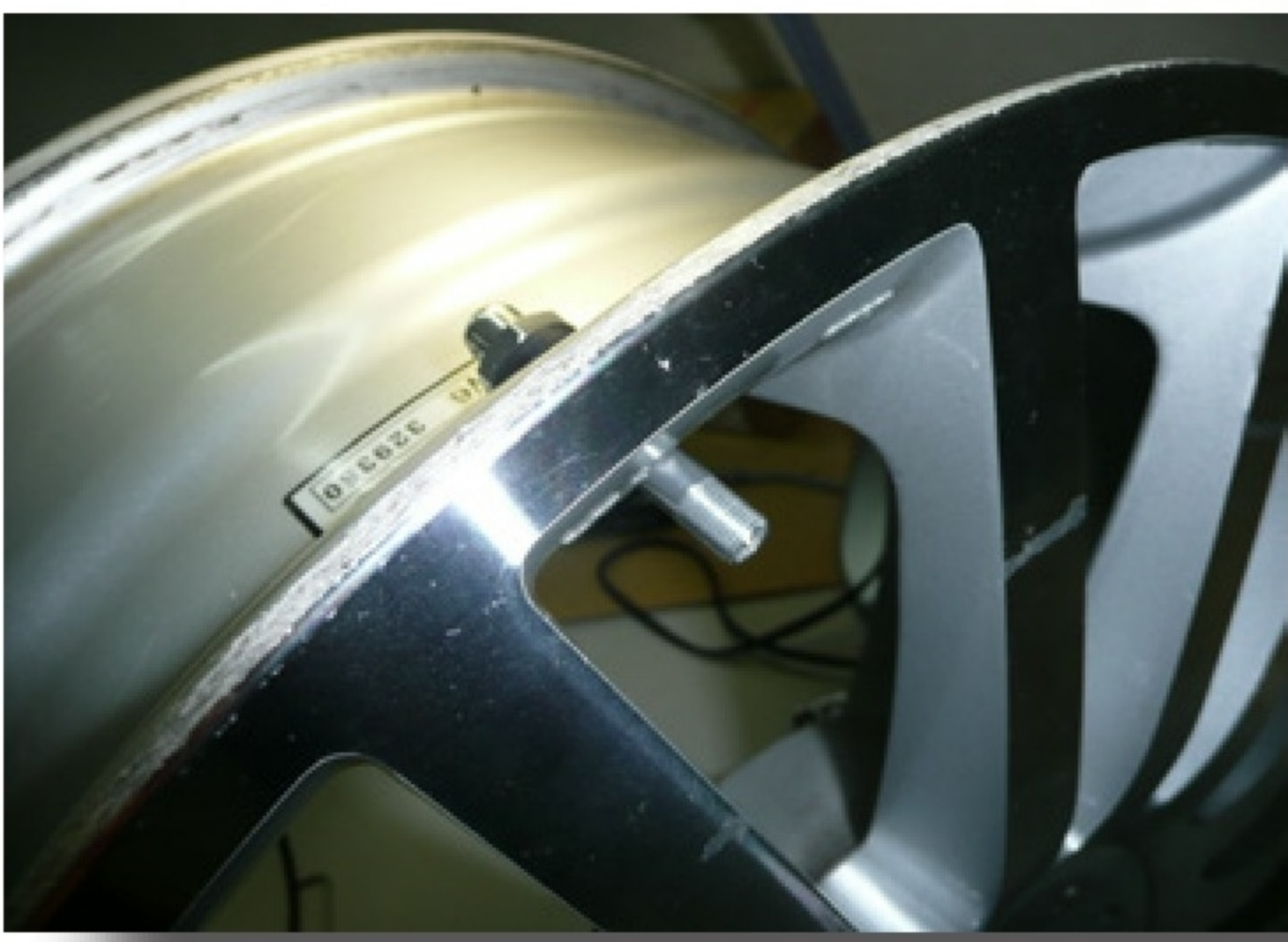
Install valve stem into the valve hole of the wheel