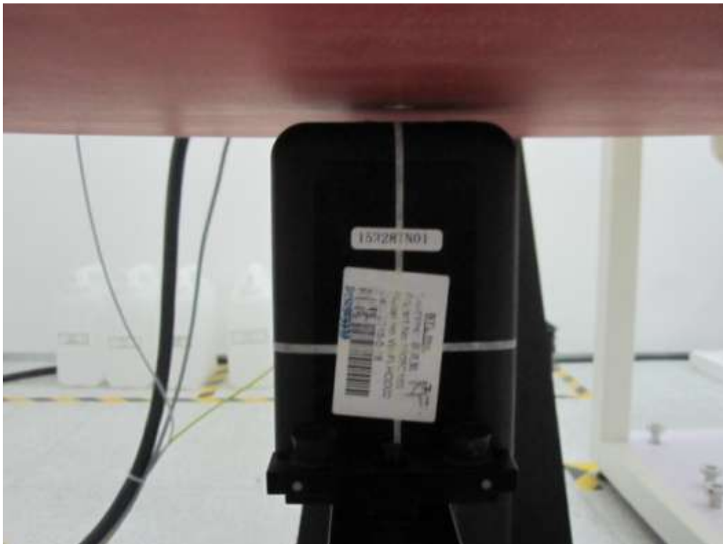
POSITION OF BODY FRONT 5mm DISTANCE