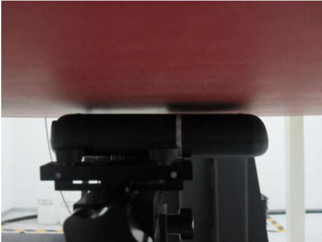
POSITION OF BODY TOWARDS GROUND WITH 5mm DISTANCE