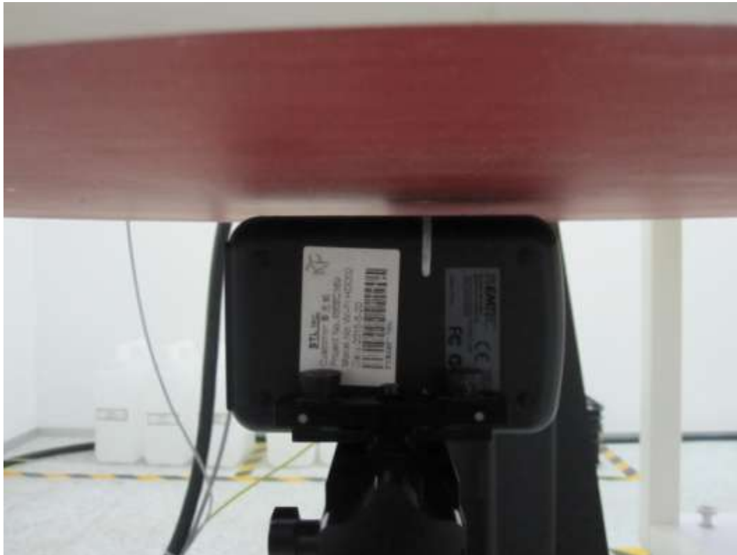
POSITION OF BODY RIGHT SIDE WITH 5mm DISTANCE