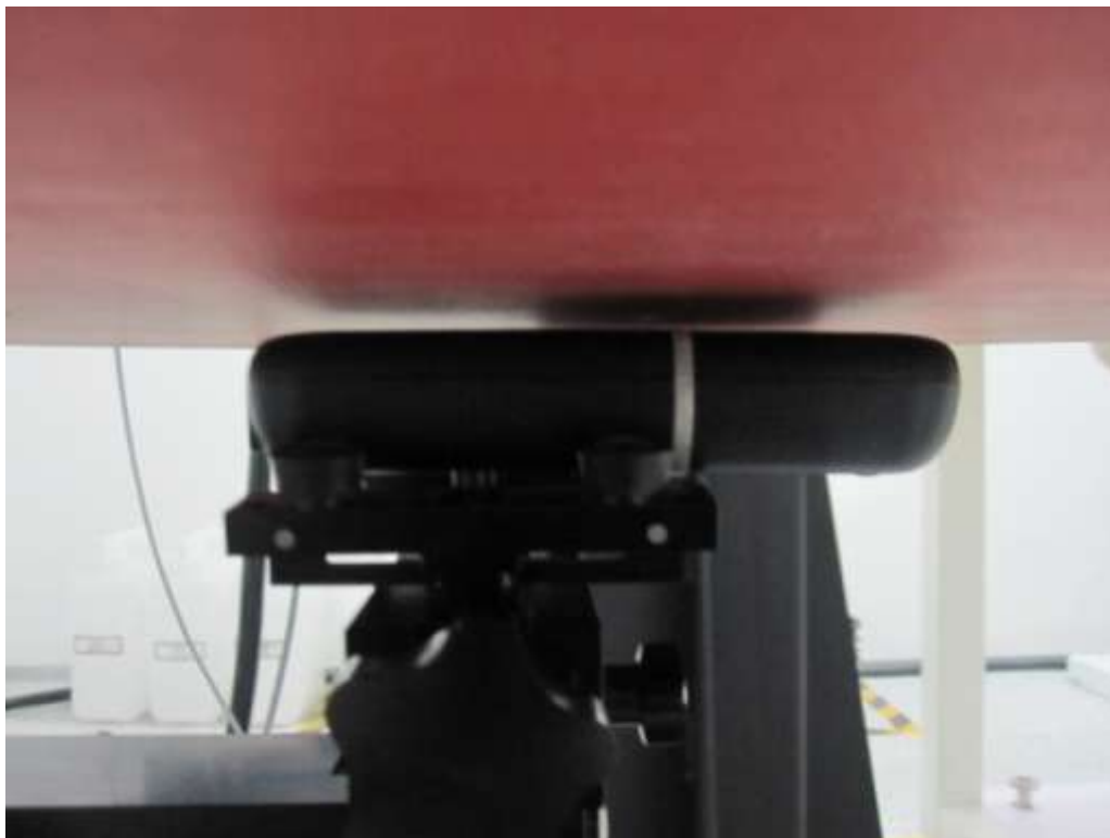
POSITION OF BODY TOWARDS PHANTOM WITH 5mm DISTANCE