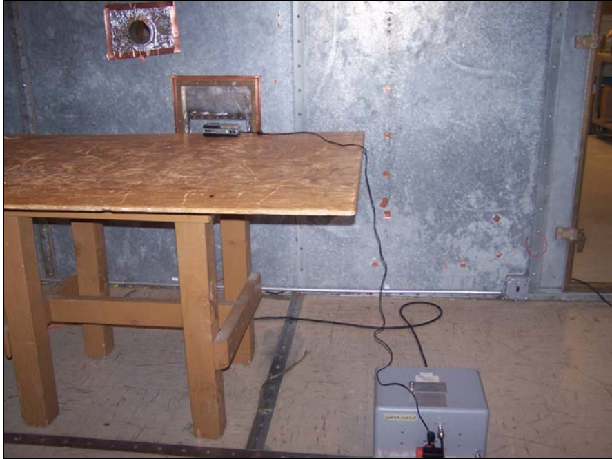
Photograph 1. Conducted Emissions Test Setup