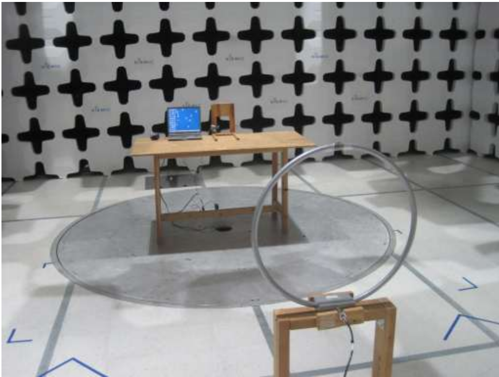
Radiated Emission (<30MHz) – Front View