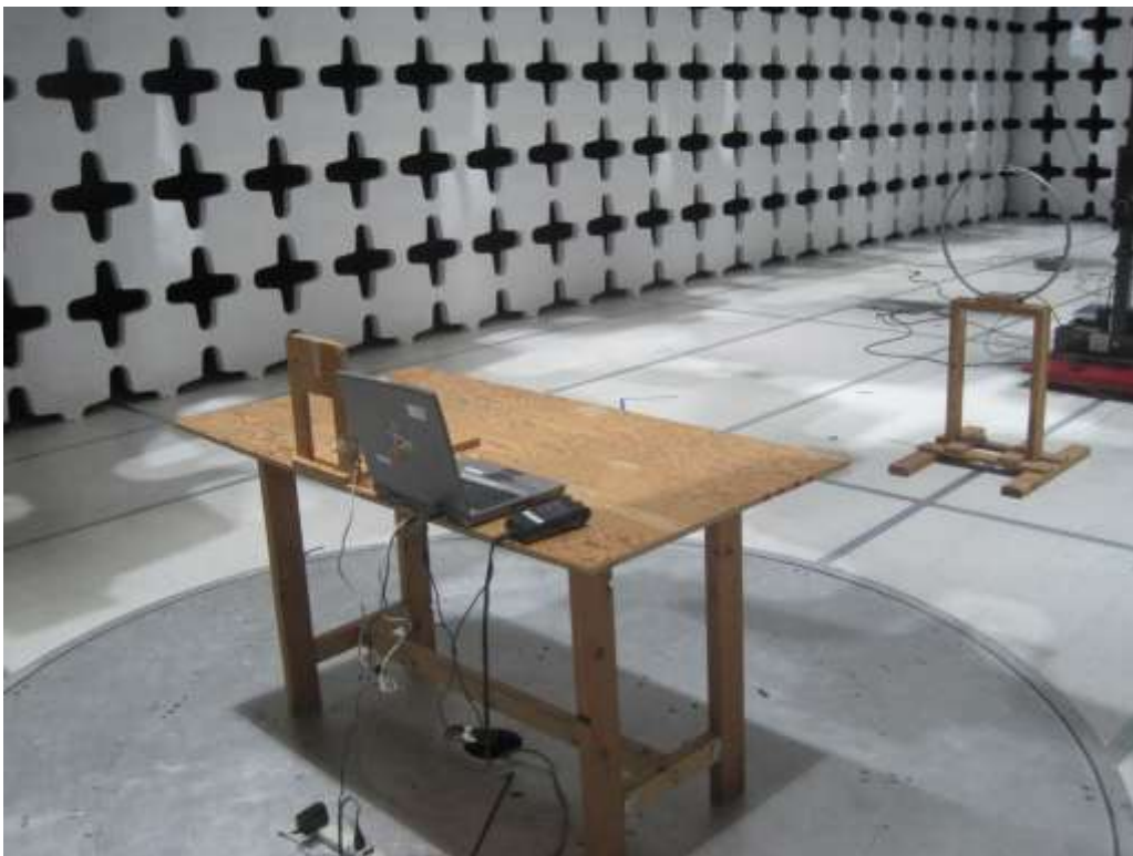
Radiated Emission (<30MHz) – Rear View