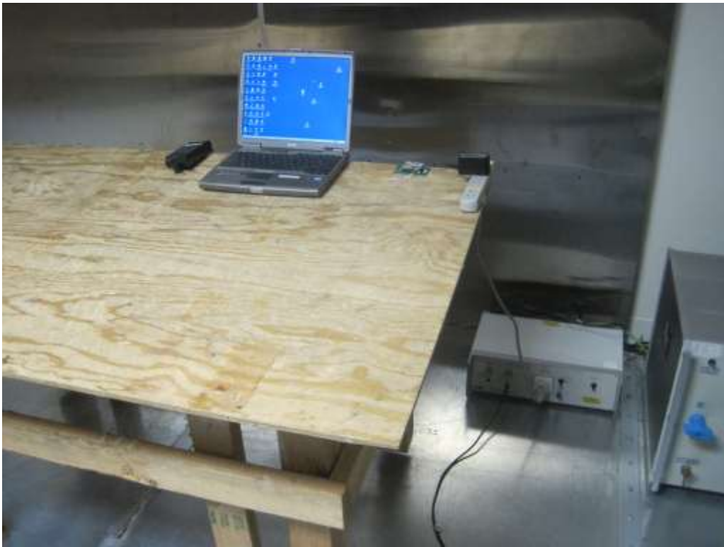
AC Line Conducted Emission - Front View