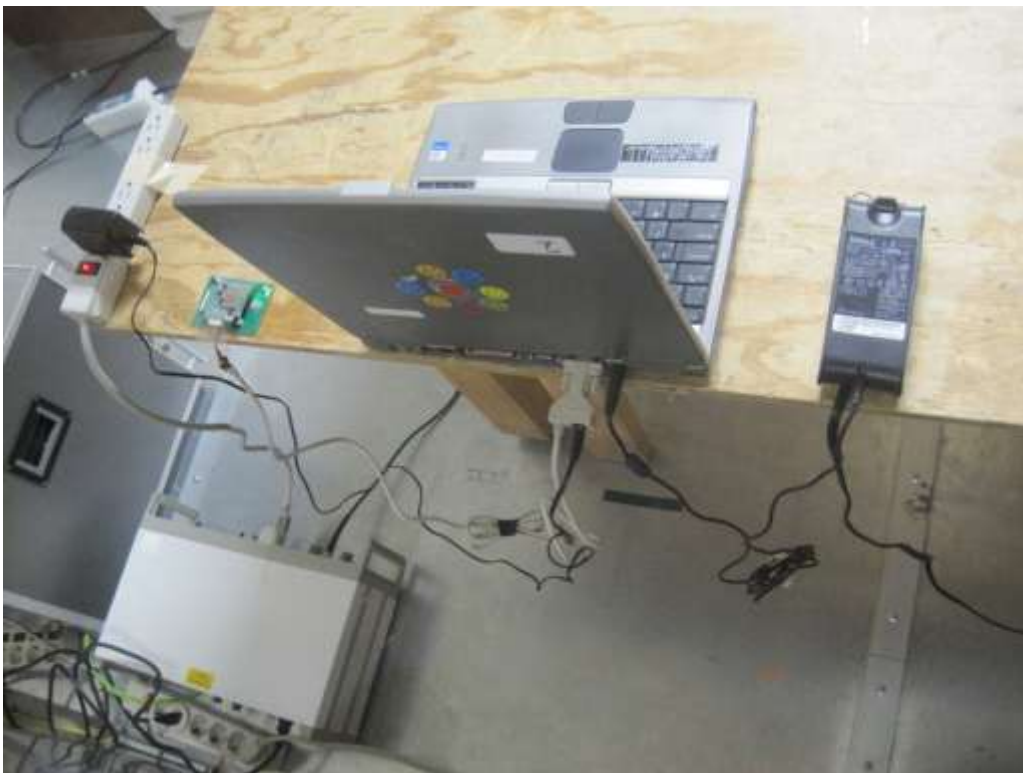
AC Line Conducted Emission - Front View