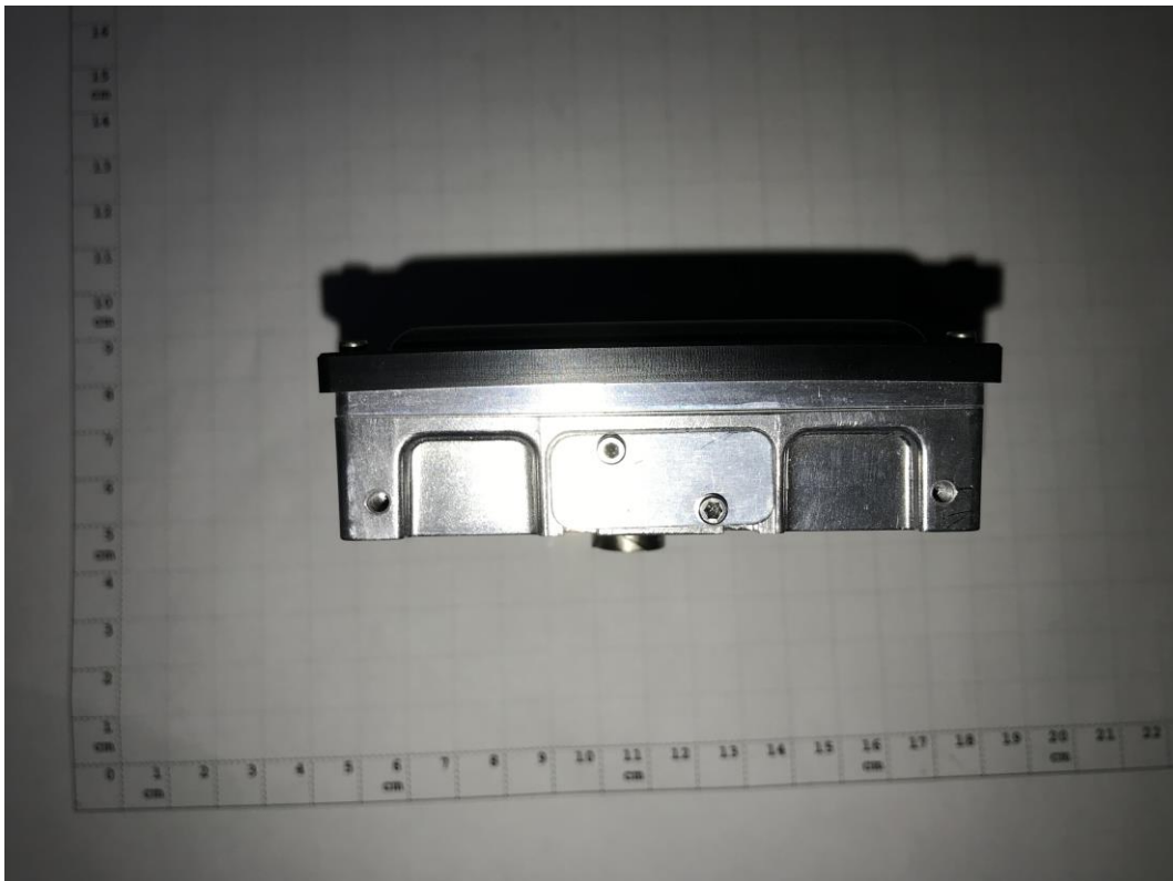
Photograph 4: EUT A, left view