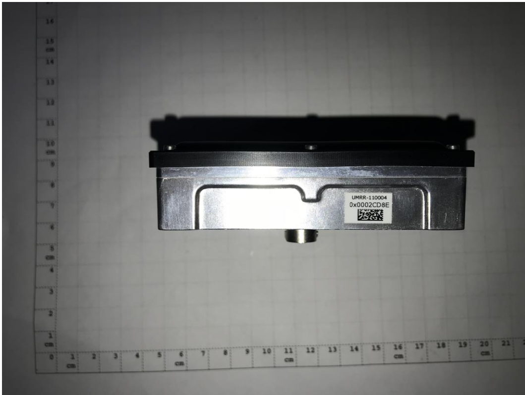
Photograph 3: EUT A, top view