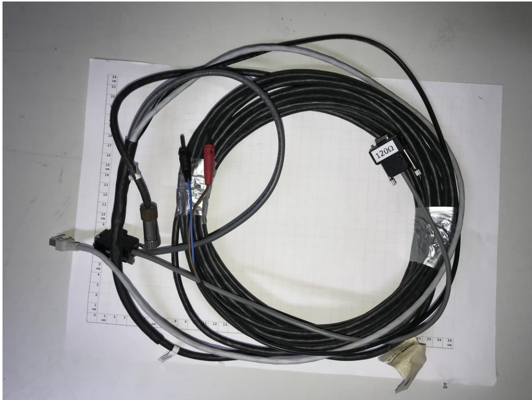
Photograph 7: AE 2