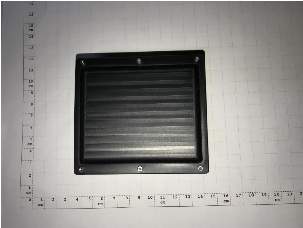
Photograph 1: EUT A, front view