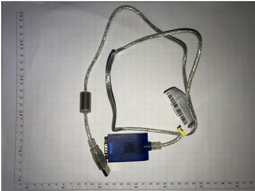
Photograph 8: AE 3