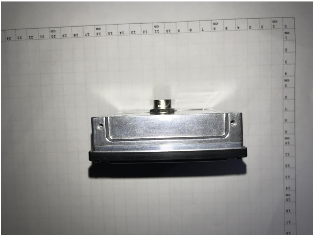
Photograph 6: EUT A, right view