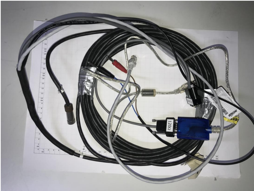
Photograph 9: AE 2 + AE 3