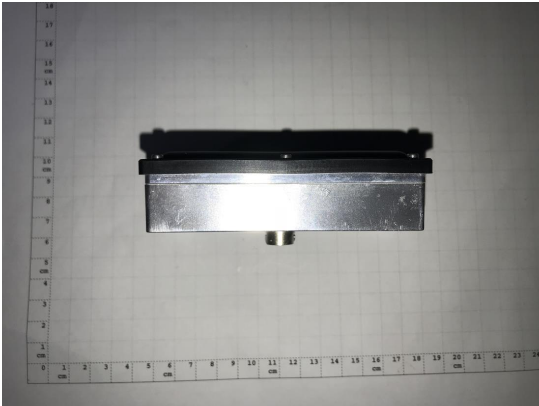
Photograph 5: EUT A, bottom view