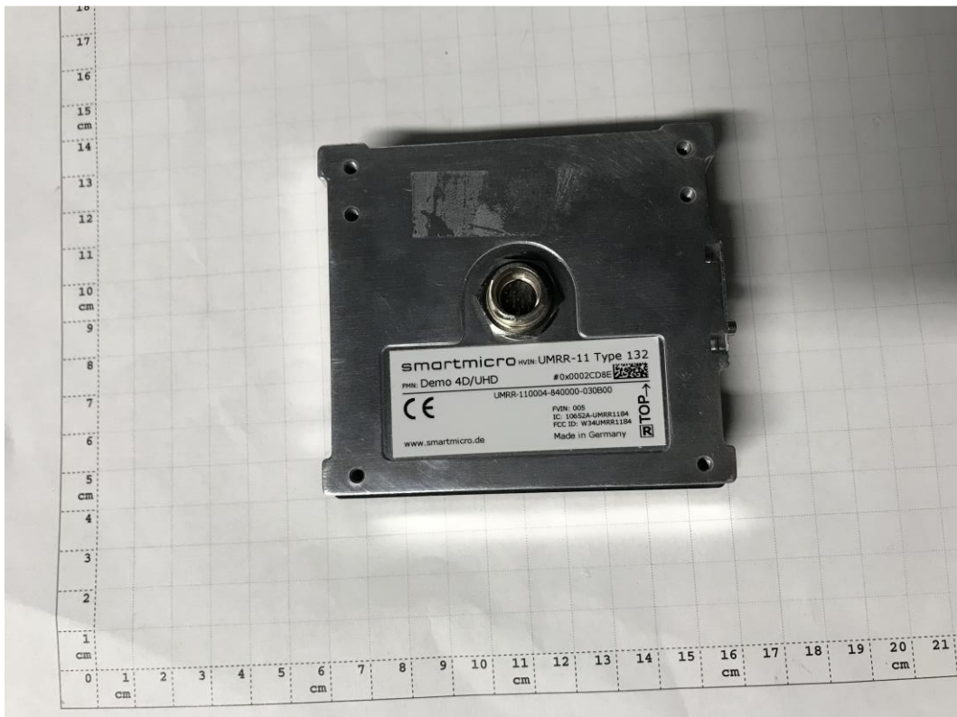
Photograph 2: EUT A, rear view