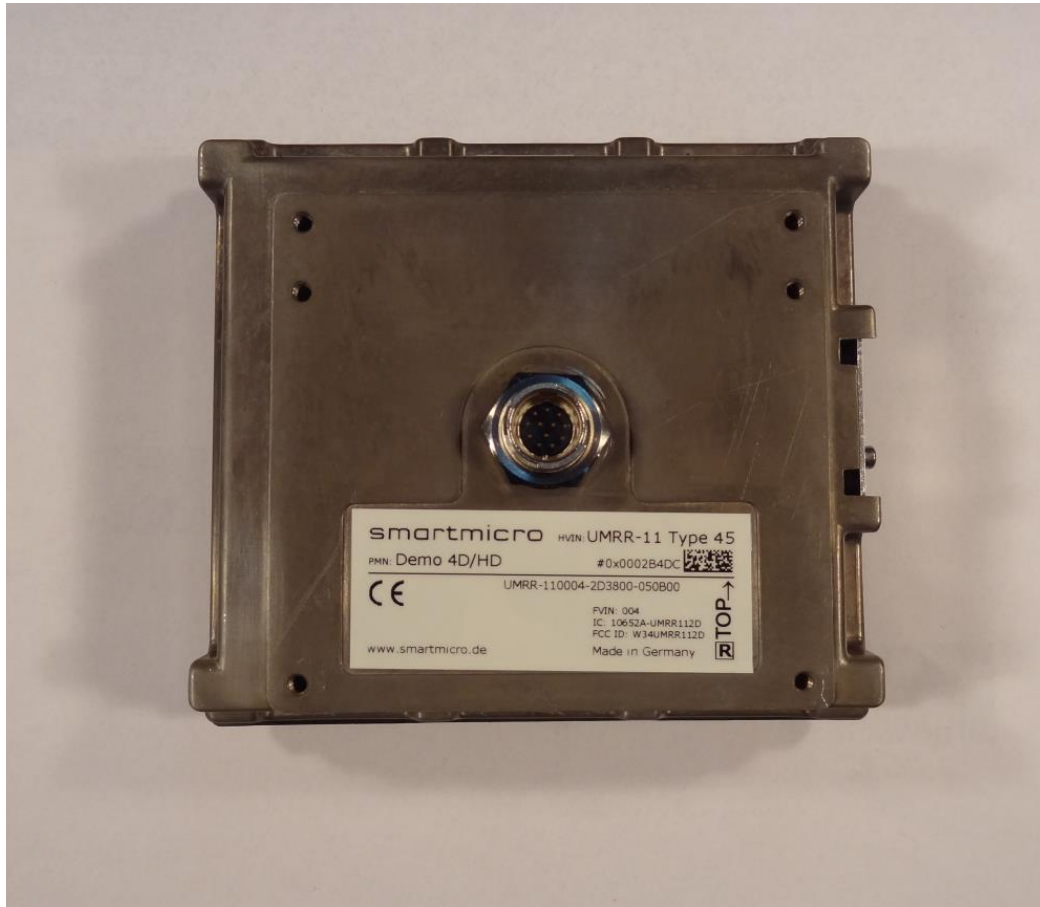
Figure 2: Label Location