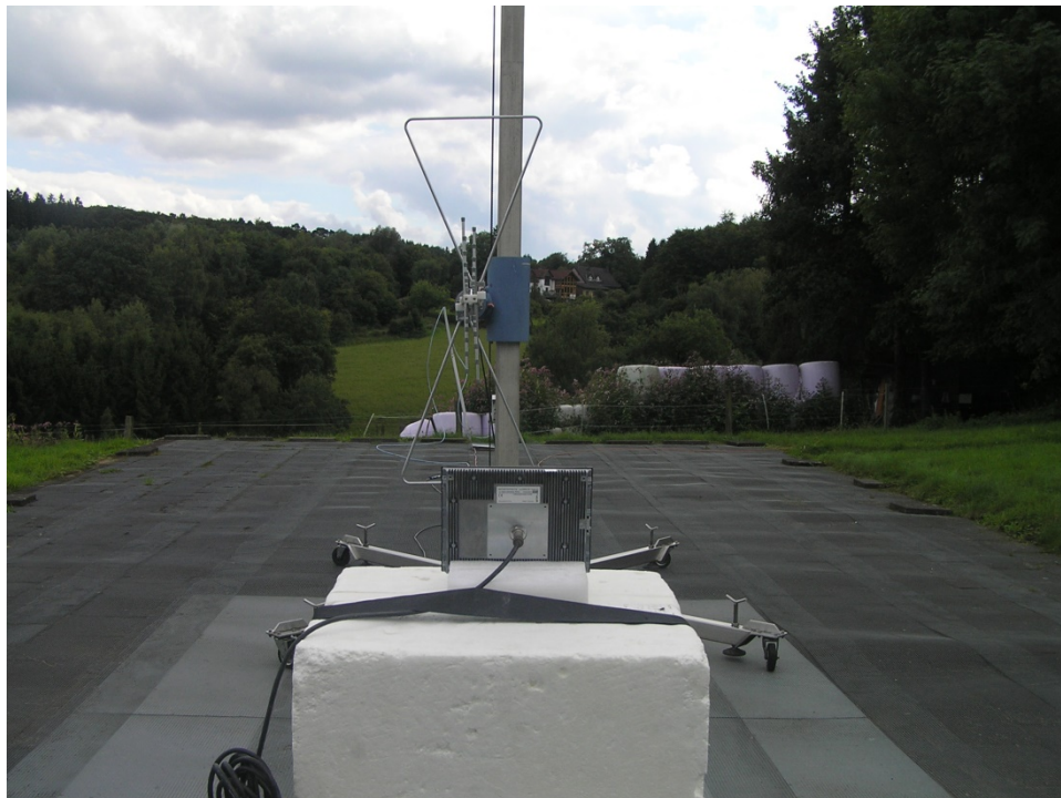
Photo to the test: Restricted bands of operation / Radiated emission limits / Fundamental frequencies – Field strength limits

EUT: UMRR-0C Type 42 FCC ID: W34UMRR0C2A FCC Title 47 CFR Part 15 C Date of issue: 2017-09-18