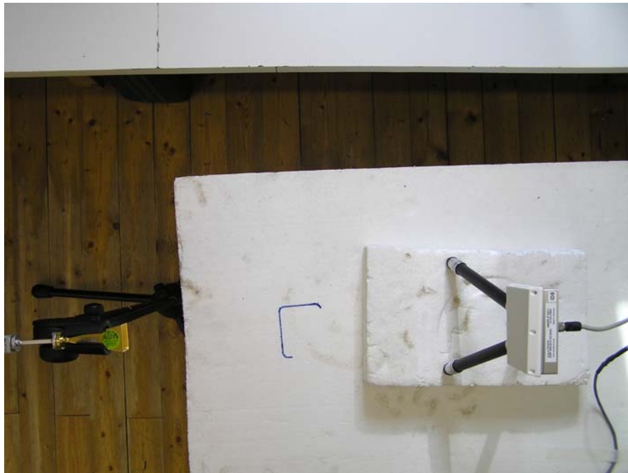
Connection between external mixer and local output from the Spectrum Analyzer