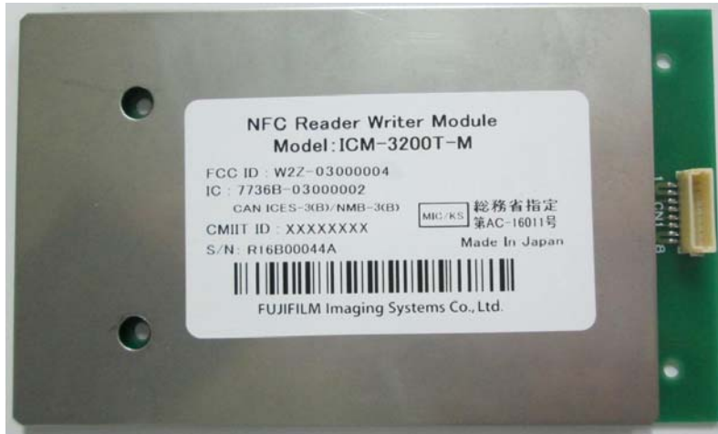
Fig2: assembling label