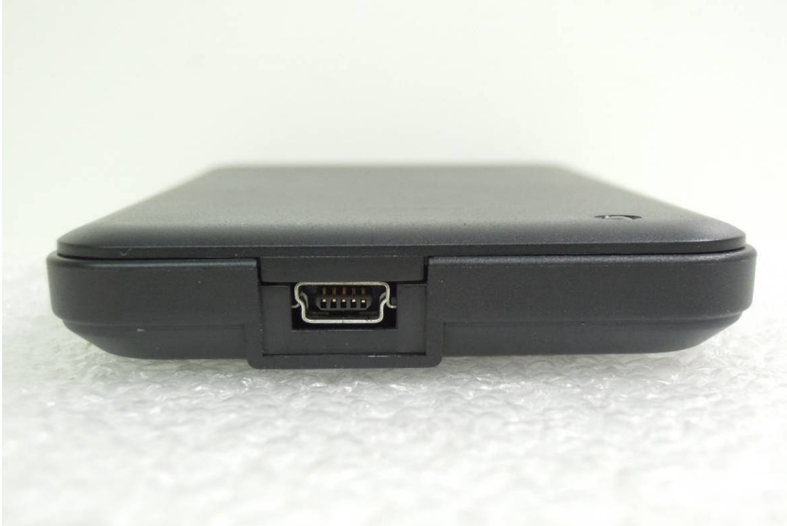
Side View of EUT – 3