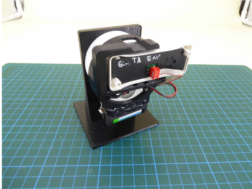
Modified EUT with mounted RFID reader for tests, view 1