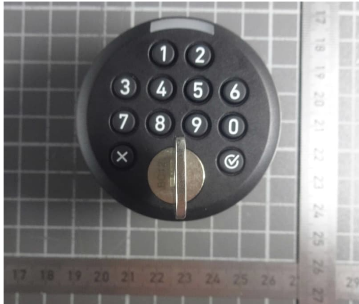
EUT top view*