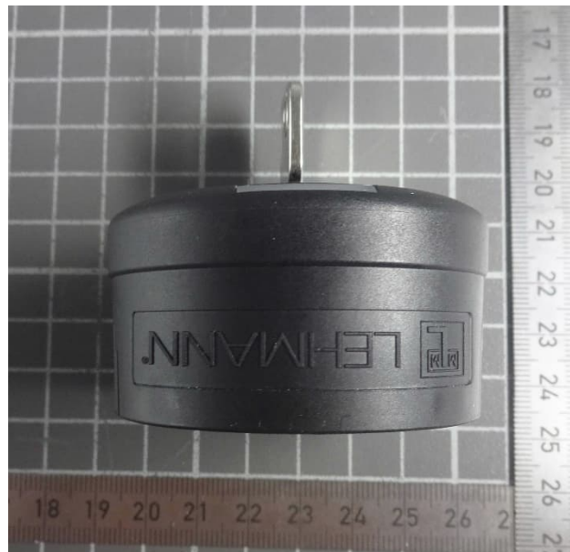
EUT side view*

Remark*:The photos are showing an identical EUT with black housing because the tested EUT was modified as shown in the following photos.