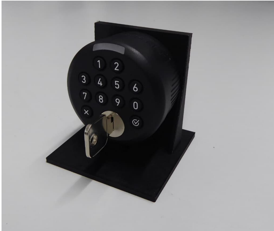
EUT total view*