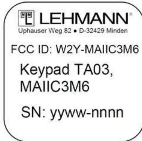
Keypad TA03 – Type label