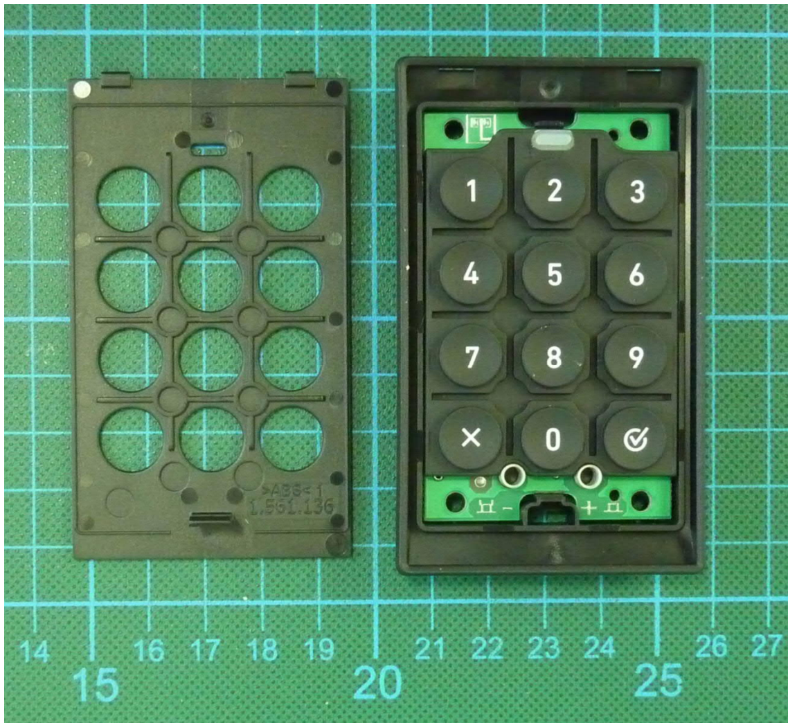
Keypad TA03 – cabinet opened