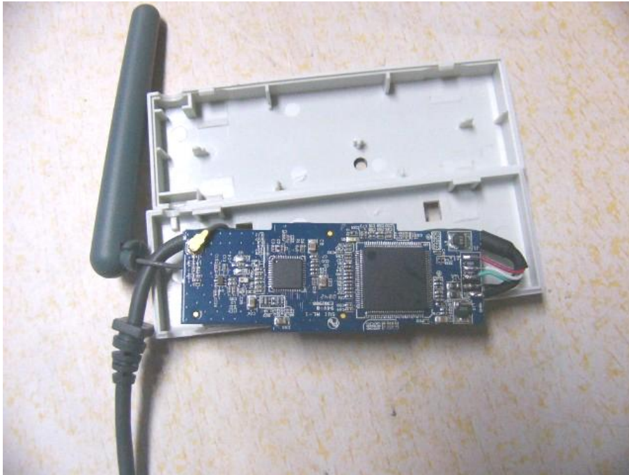
Main & RF board component side