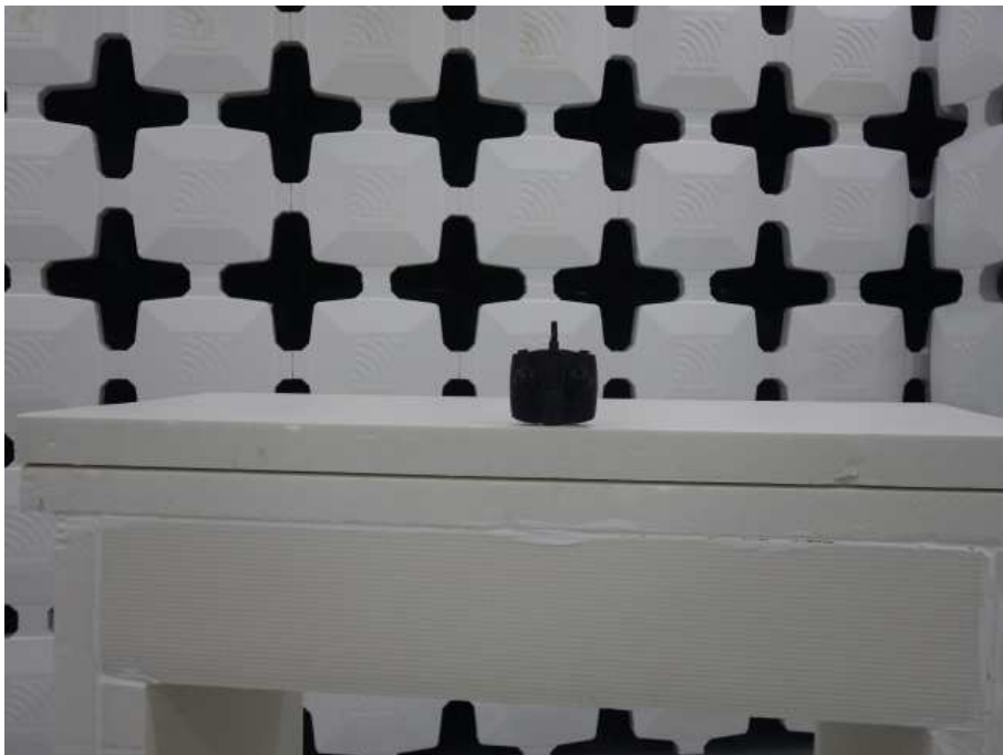
Up to 1GHz (The EuT placed at the center of the turntable)