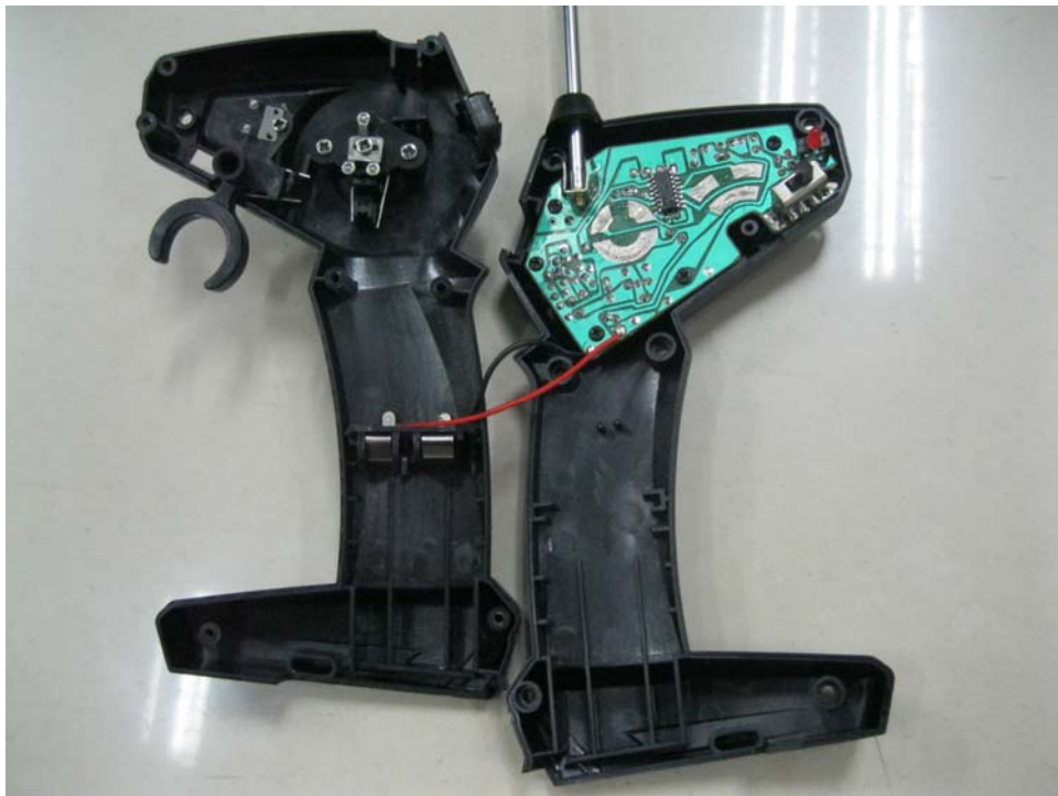
Internal View of EUT