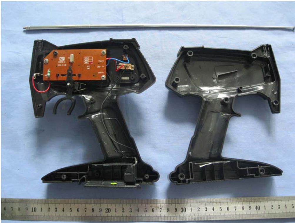
Internal View of EUT