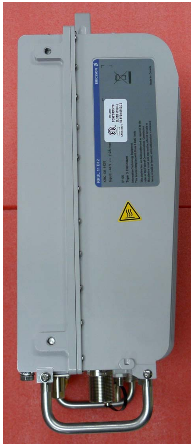
Figure 5: RRUL Side View (Solar Shield removed) Figure 6: RRUL Side View (Solar Shield removed)