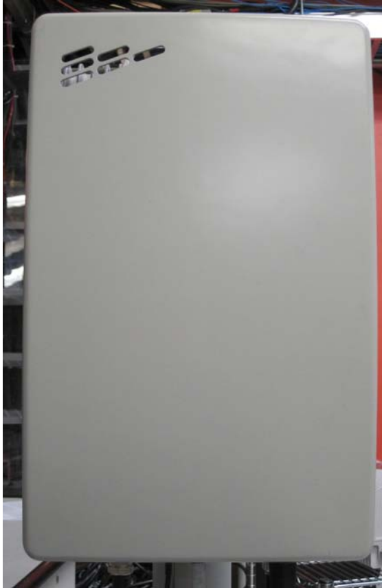
Figure 1: RRUL Front View (with Solar Shields)