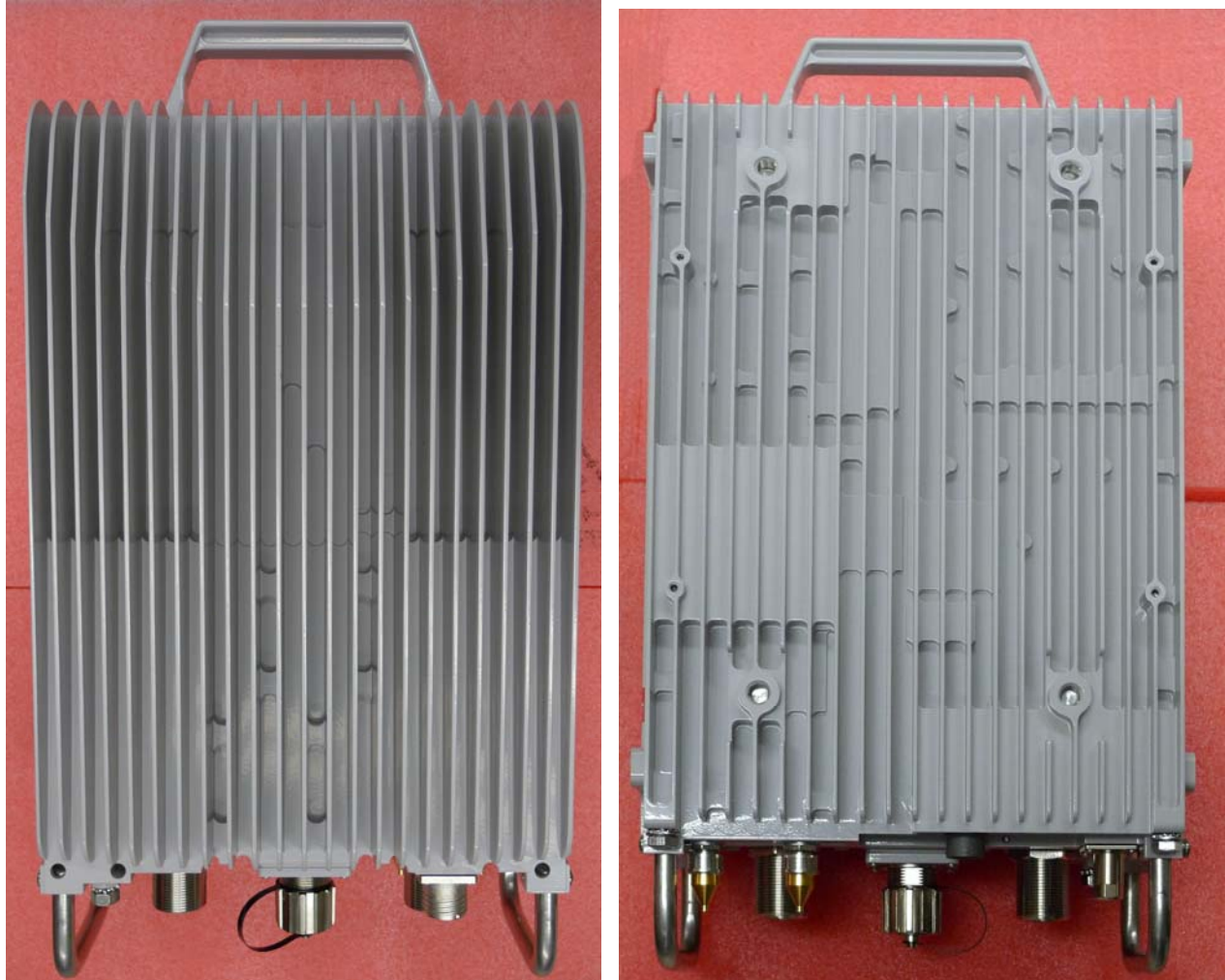
Figure 3: RRUL Front View (Solar Shield removed) Figure 4: RRUL Rear View (Solar Shield removed)