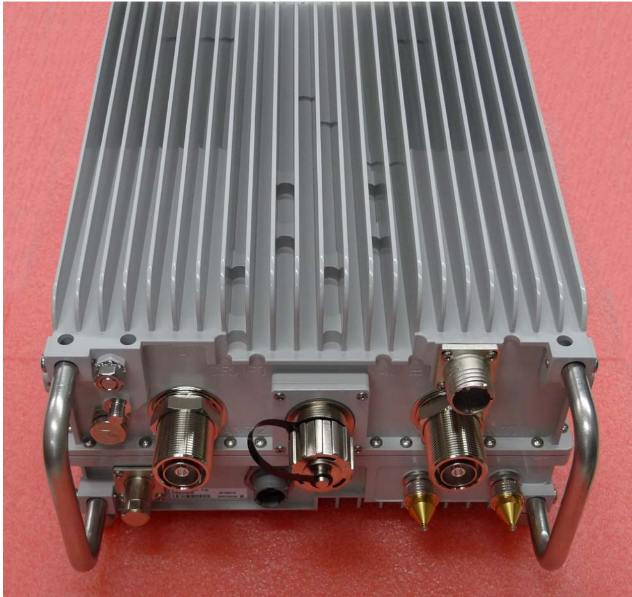
Figure 7: RRUL Bottom Front View (Solar Shield removed)