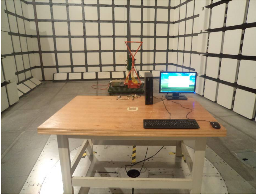
Radiated Emissions – Rear View (30-1000 MHz)