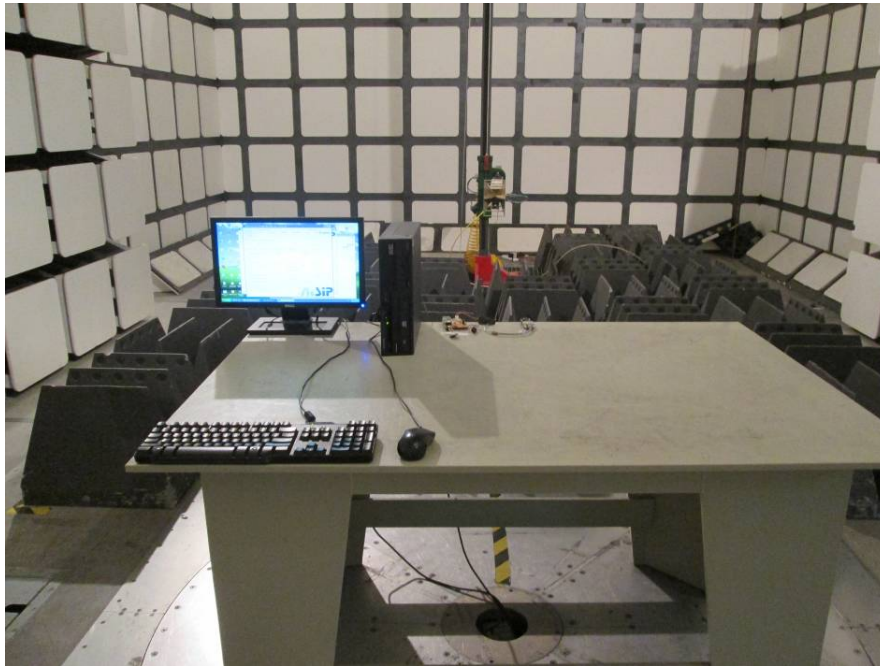
Radiated Emissions – Rear View (1-25 GHz)