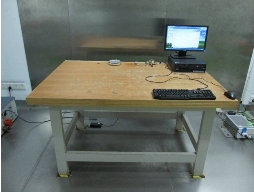
Conducted Emissions - Side View