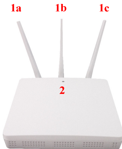
EAP760 Front View