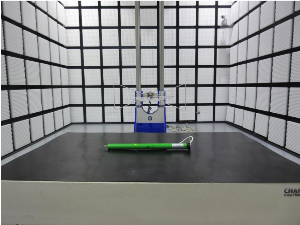
Radiated Emission test above 1GHz