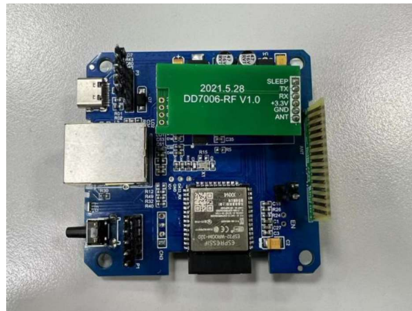
DD7006A, DD7006C Internal: Top

Model: DD7006, DD7006A, DD7006B, DD7006C, DD7006E