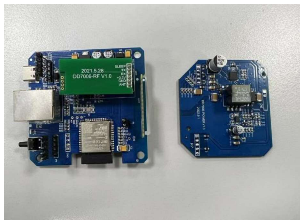
DD7006, DD7006B, DD7006E Internal: Inside