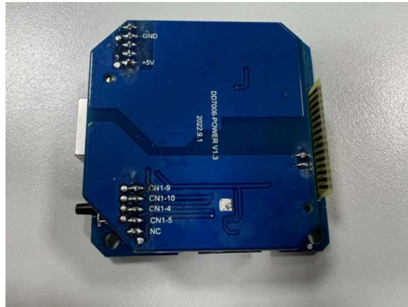
DD7006, DD7006B, DD7006E Internal: Top