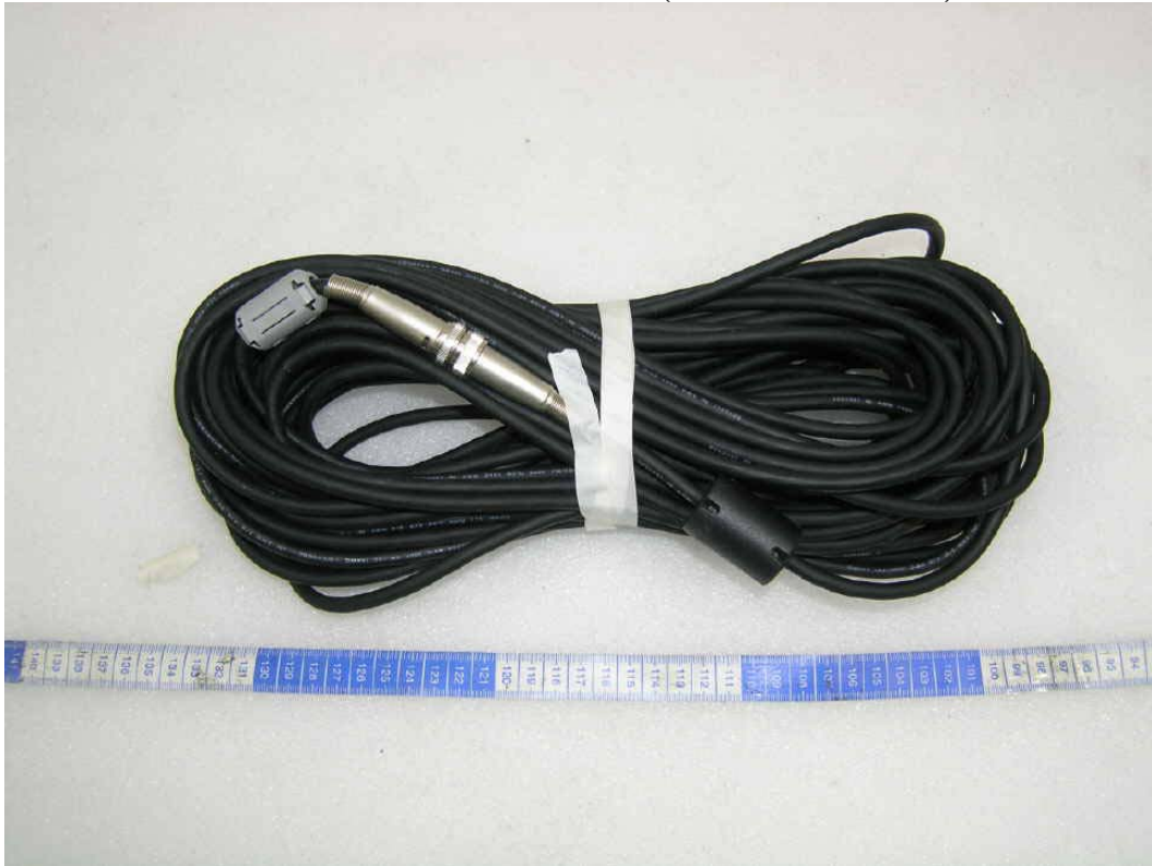
15 ft EXTENSION POWER CORD (MODEL: 1501047)