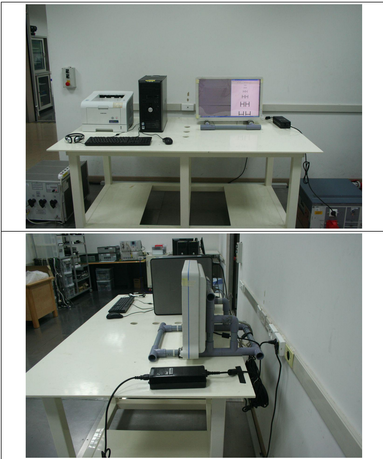
Figure 1. Conducted Emission Test Setup for DVI Mode: