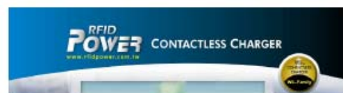
Contactless Twins Charger for Wii Remote Control Wi08 User's Manual