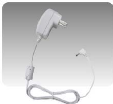
AC adapter x 1