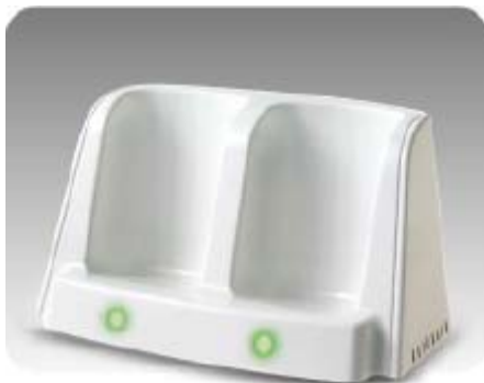
Contactless power charger stand x 1