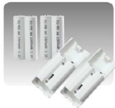
Remote control battery module x 2