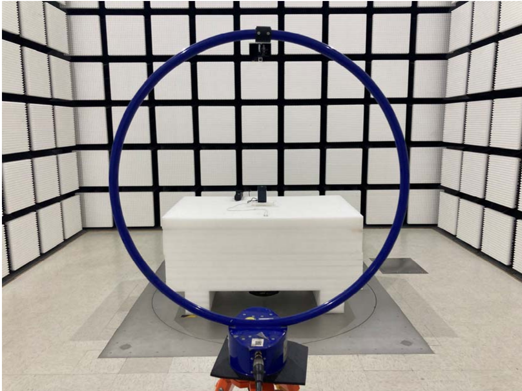
Radiated Emission Below 1G Perpendicular View