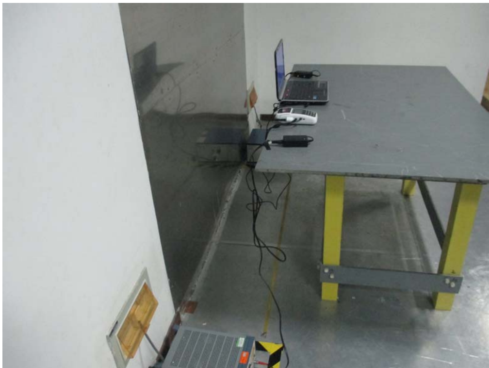
Conducted Emissions Test Setup Side View