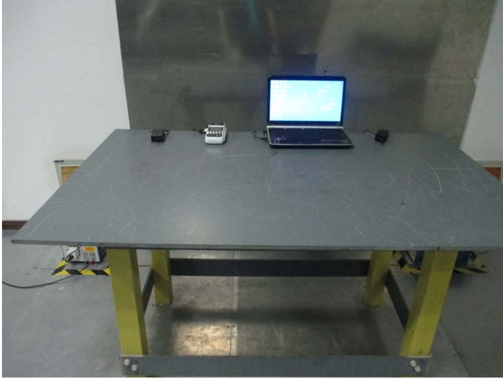
Conducted Emissions Test Setup Front View