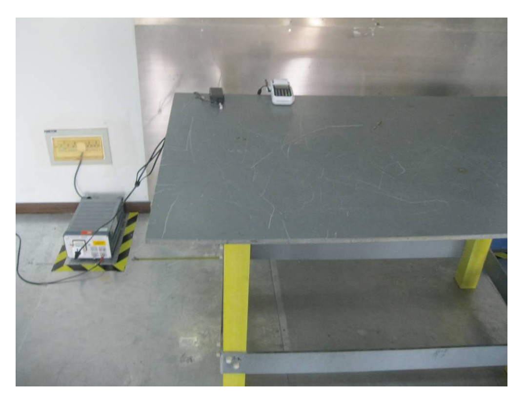
Conducted Emission Test Setup Front View