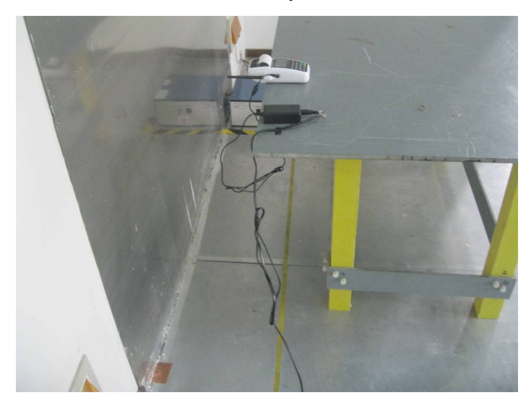
Conducted Emission Test Setup Side View