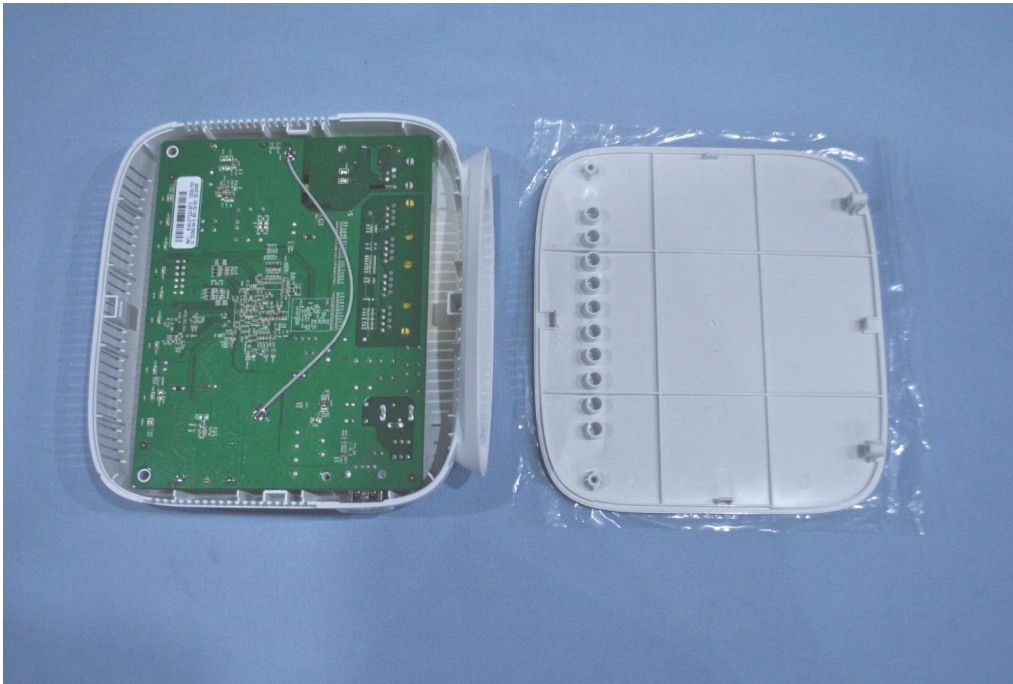
Main & RF board component side