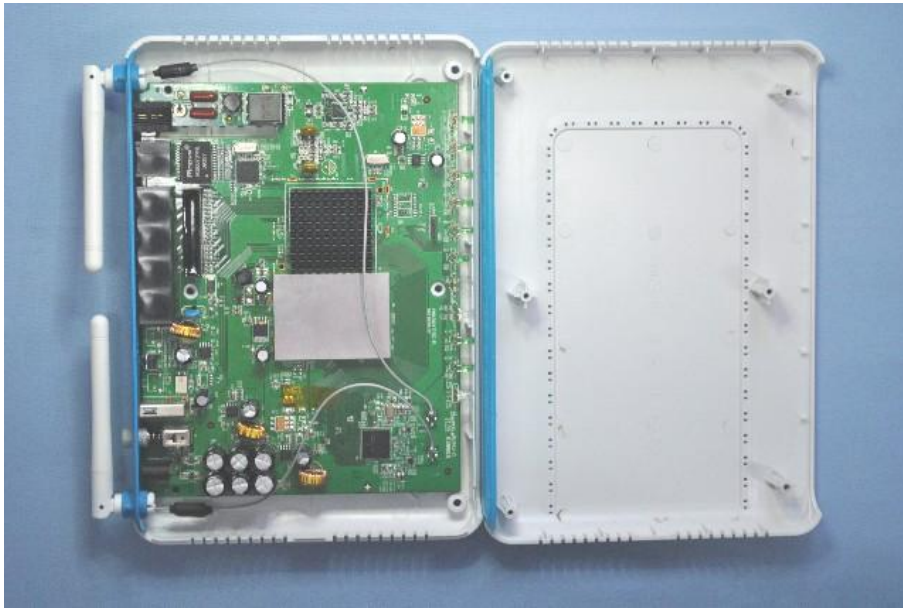
Main & RF board component side