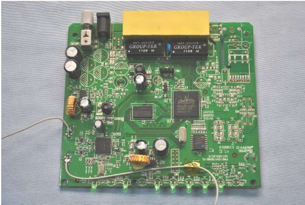
Main & RF board solder side