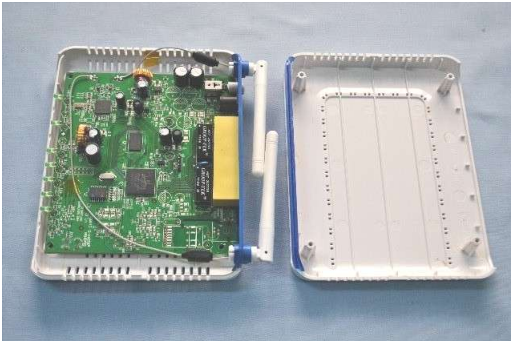
EUT inside whole view