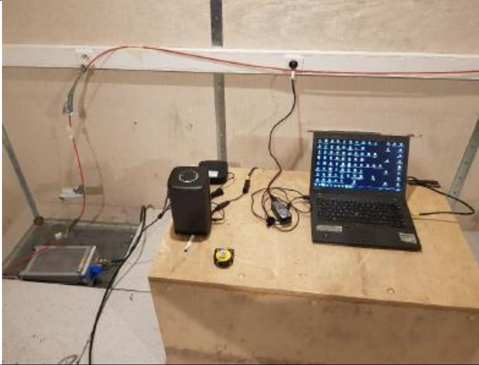
RADIATED MEASUREMENTS FROM 30 MHz to 1 GHz