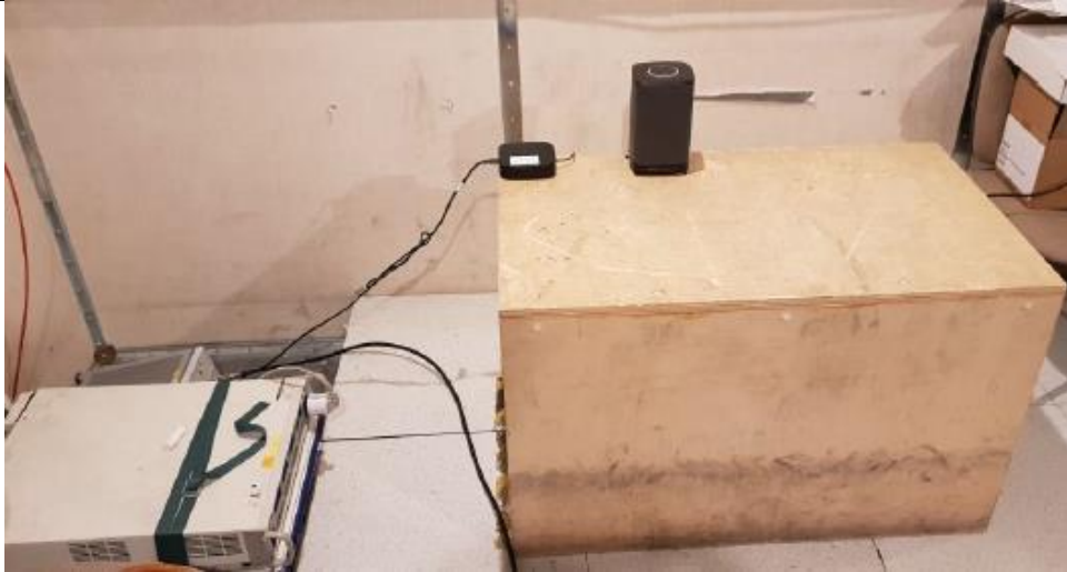
UNWANTED EMISSIONS IN RESTRICTED FREQUENCY BANDS RADIATED MEASUREMENTS (30 – 1000 MHz and 1 – 6 GHz)