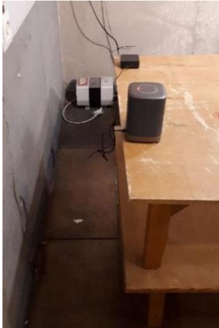
Conducted emission measurement (2)