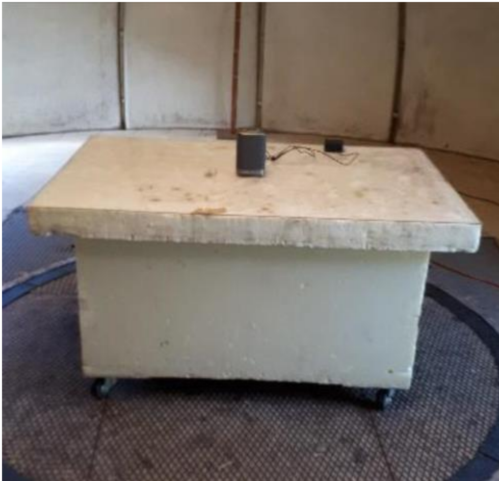
Radiated Emission measurement below 1GHz