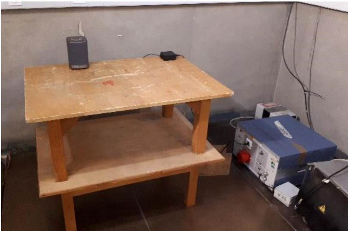
Conducted emission measurement (1)