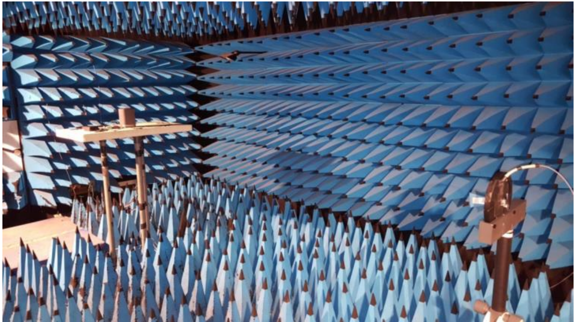
Radiated Emission measurement above 1GHz (2)