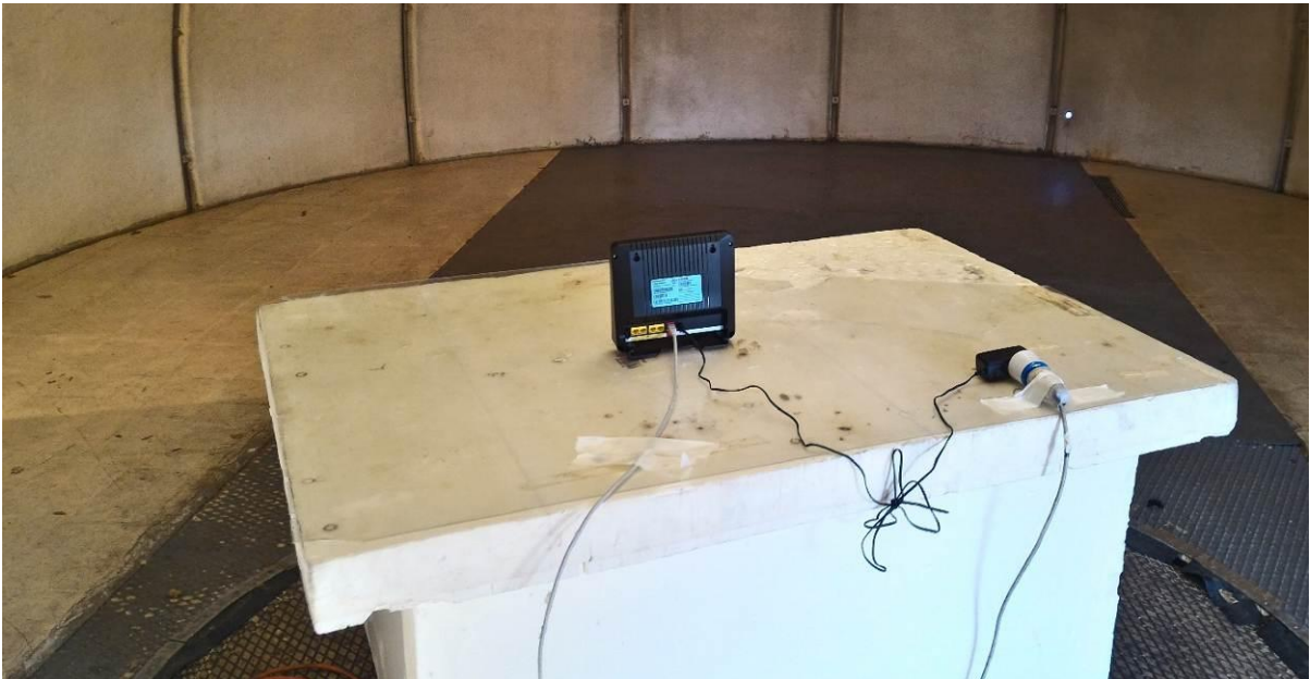
Test setup for radiated field strength ( f < 1\text{GHz} )