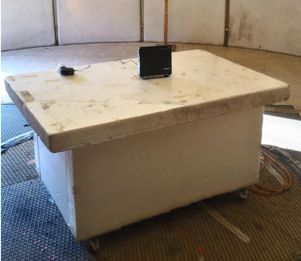
Test setup for radiated field strength ( f < 1\text{GHz} )