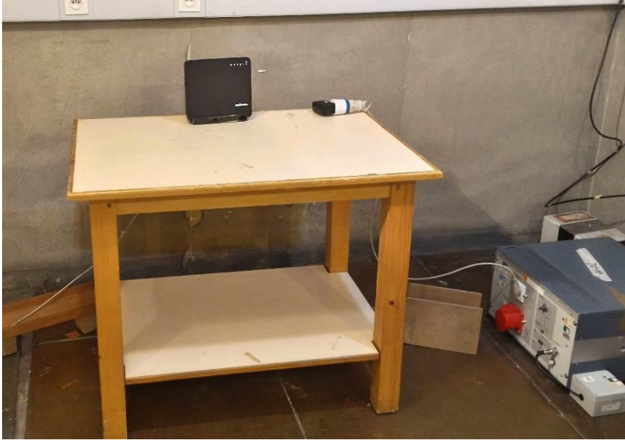
Test setup for power line conducted emissions