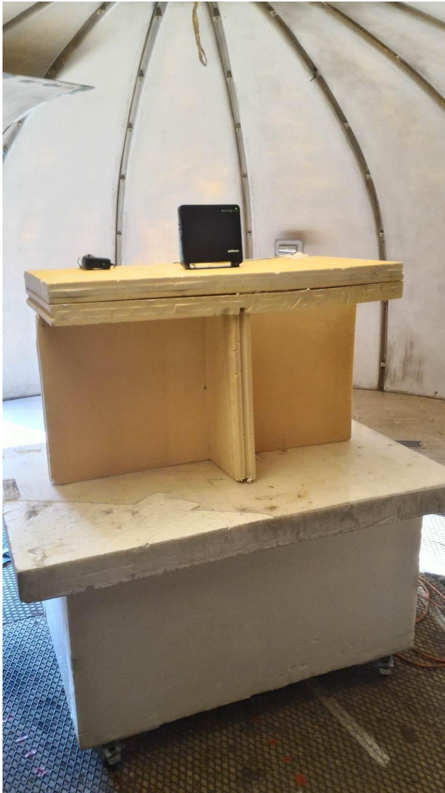
Test setup for radiated field strength ( f > 1\text{GHz} )