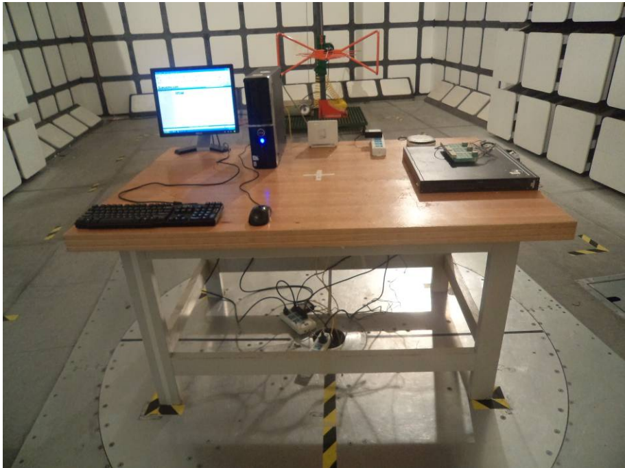
Spurious Radiated Emissions – Rear View (30 MHz - 1 GHz)