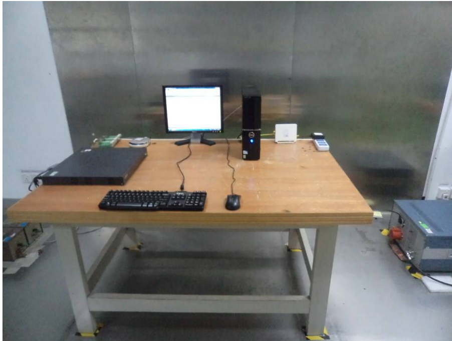
Conducted Emissions- Side View