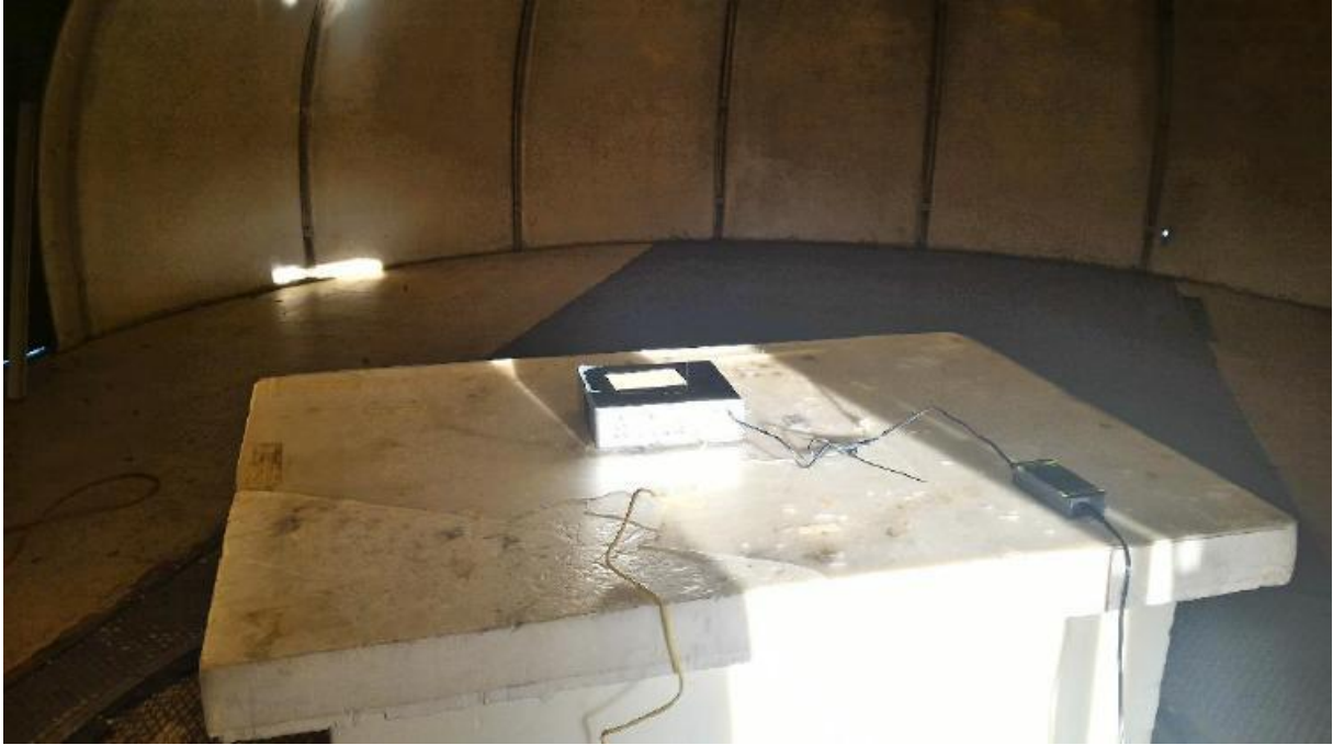
Test setup for radiated field strength ( f < 1\text{GHz} )