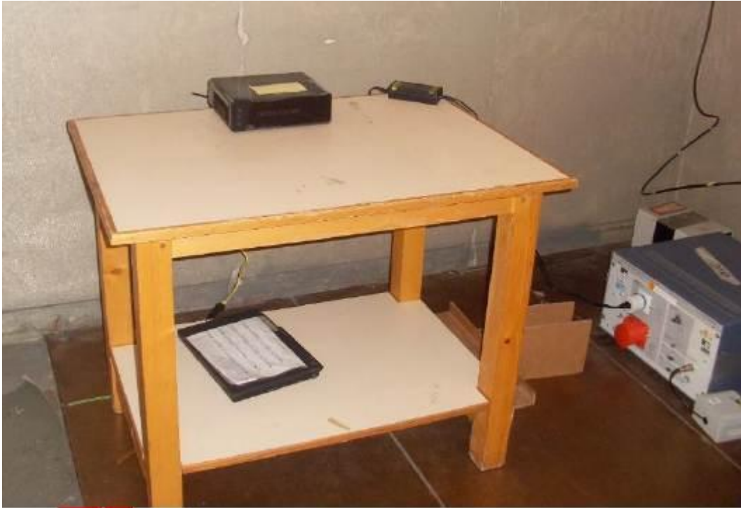
Test setup for power line conducted emissions