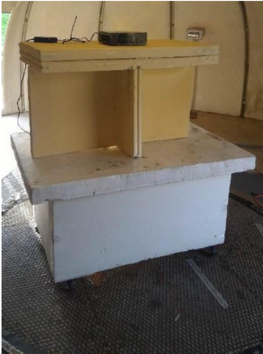
Test setup for radiated field strength ( f > 1\text{GHz} )