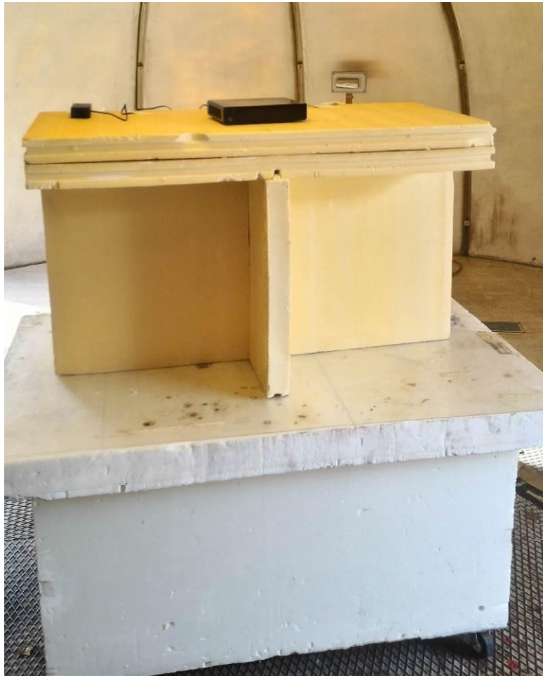
Test setup for radiated field strength ( f > 1\text{GHz} )