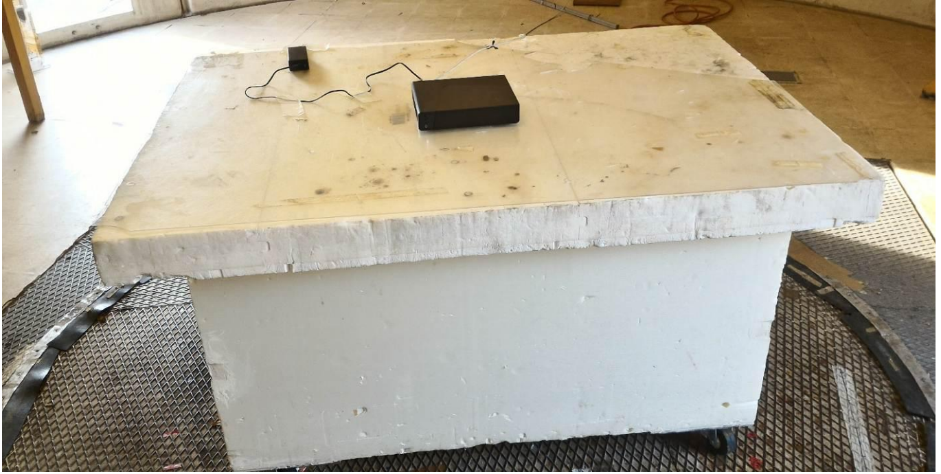
Test setup for radiated field strength ( f < 1\text{GHz} )