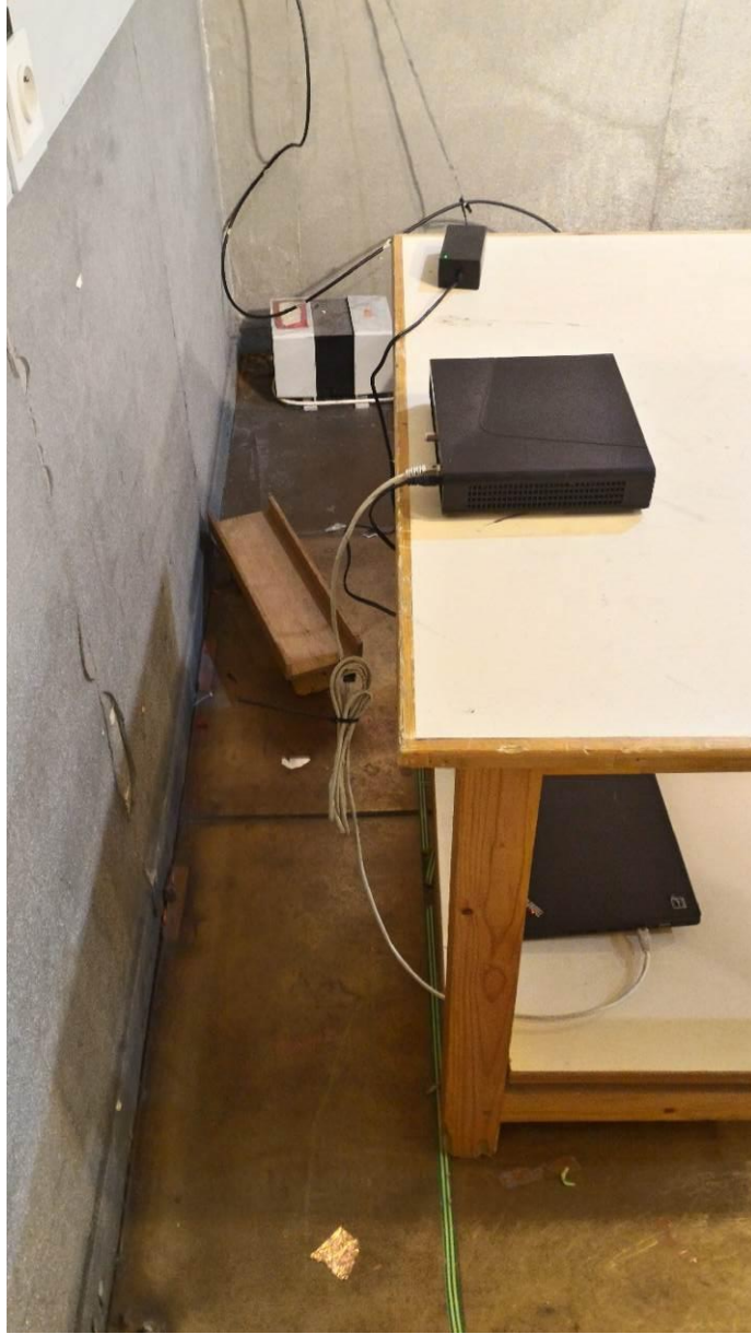
Test setup for power line conducted emissions