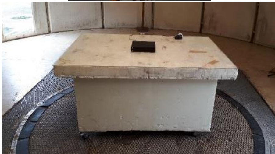
Radiated Emission measurement below 30MHz