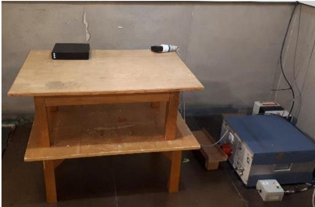
Conducted emission measurement