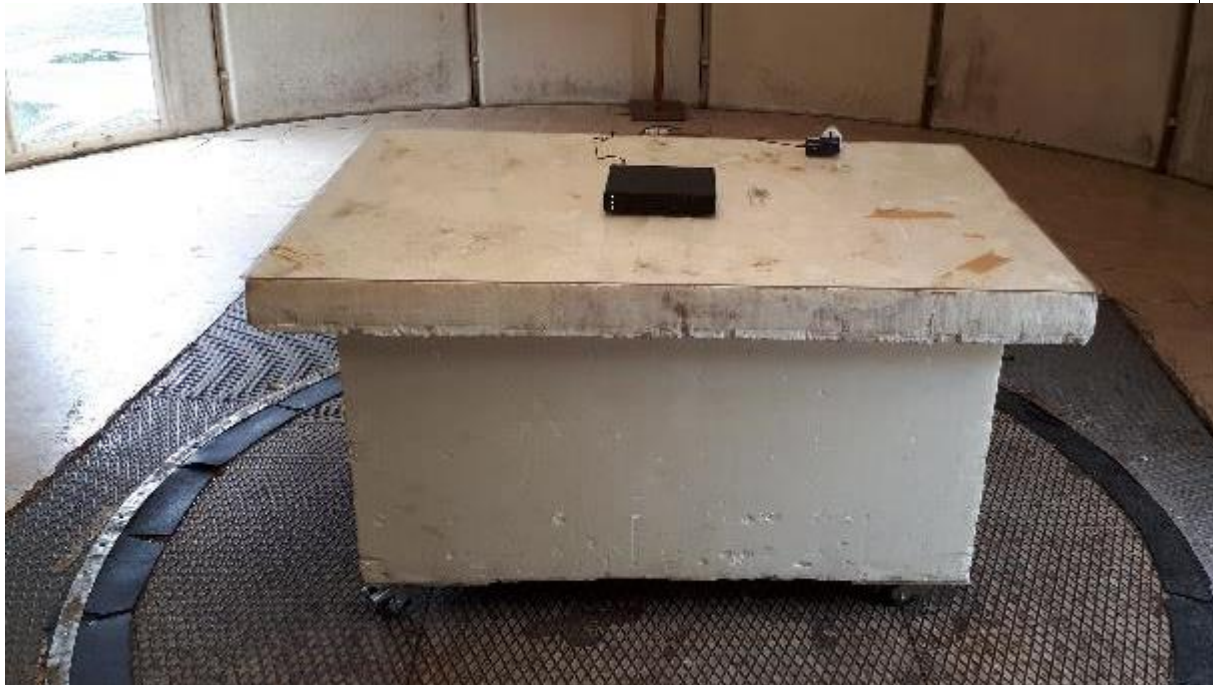
Radiated Emission measurement between 30MHz & 1GHz