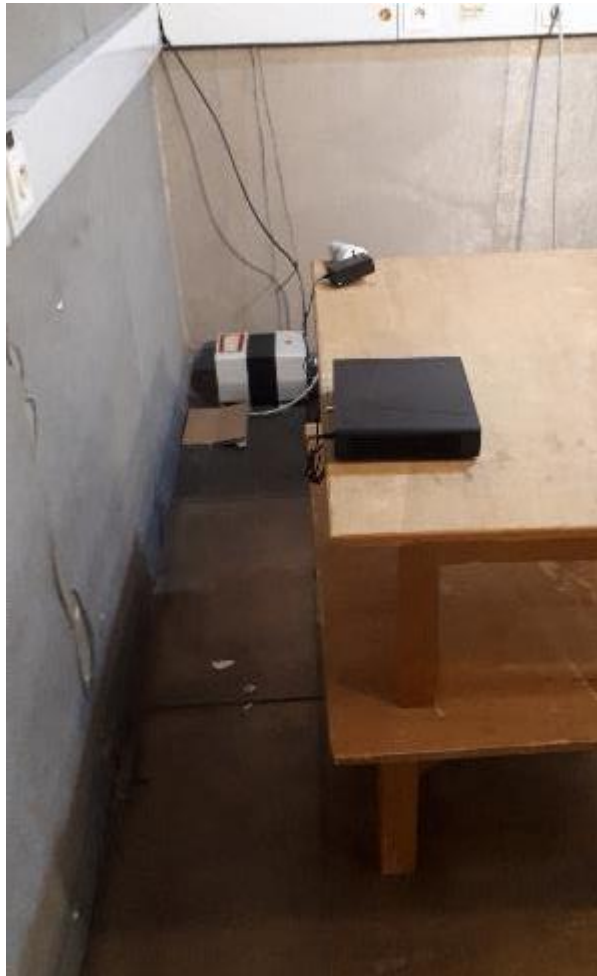
Conducted emission measurement