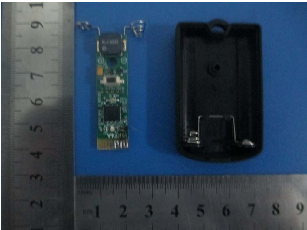
Cover Off - Top View 2