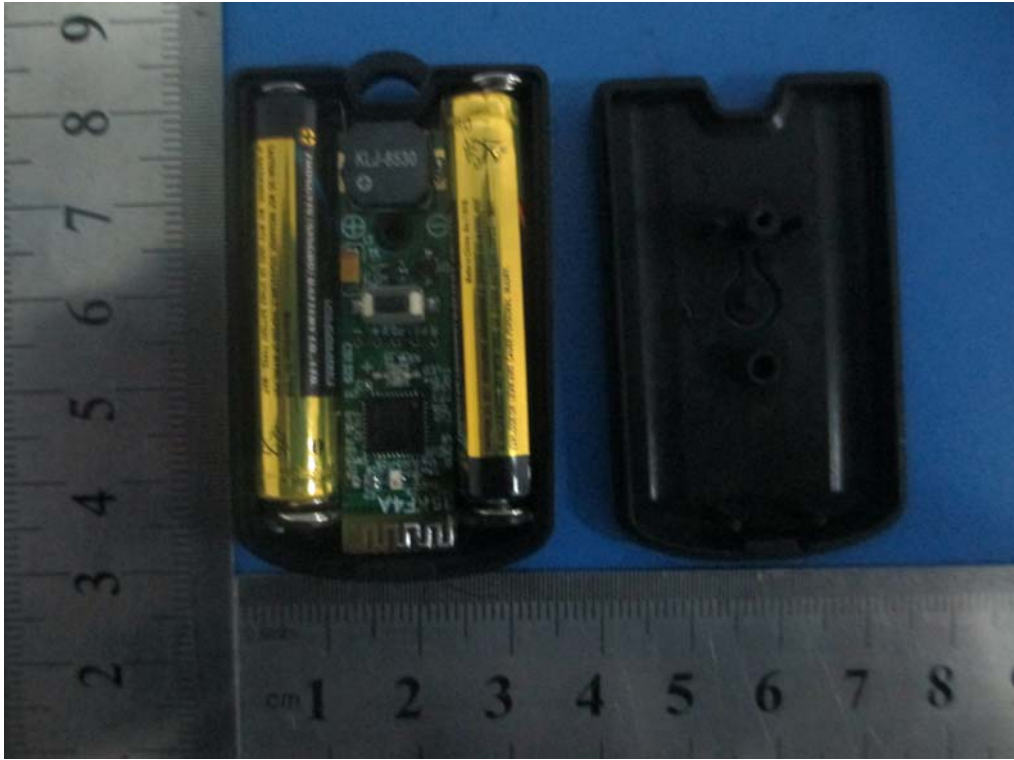
Cover Off - Top View 1