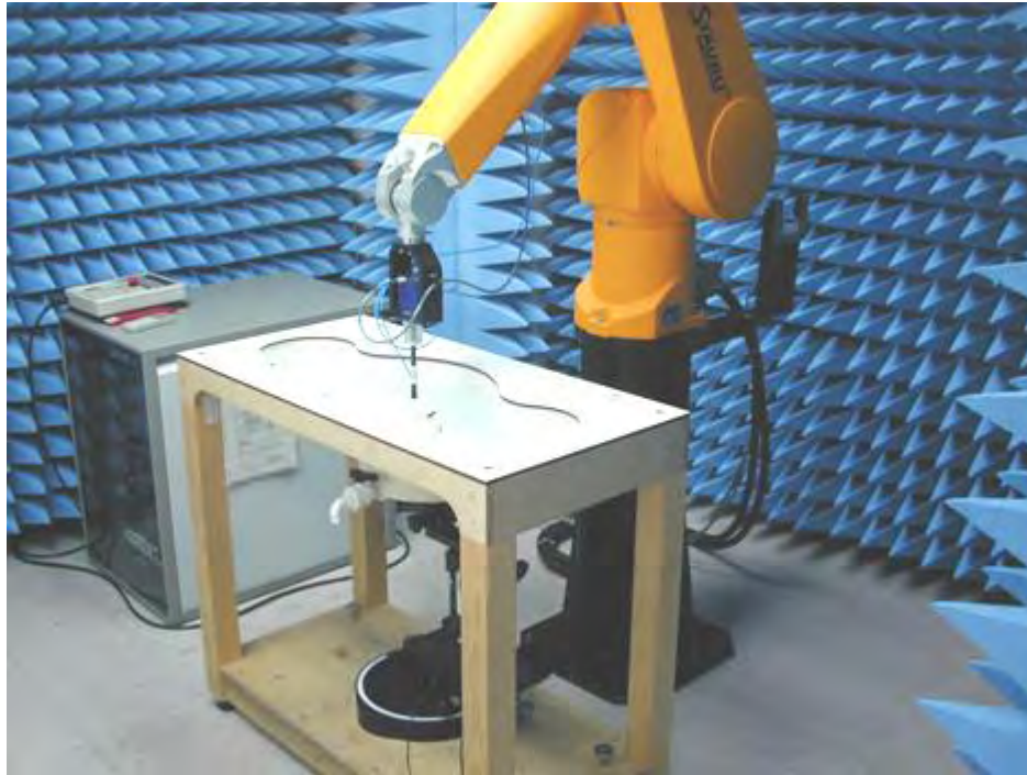
Fig.1 Photograph of the SAR measurement System