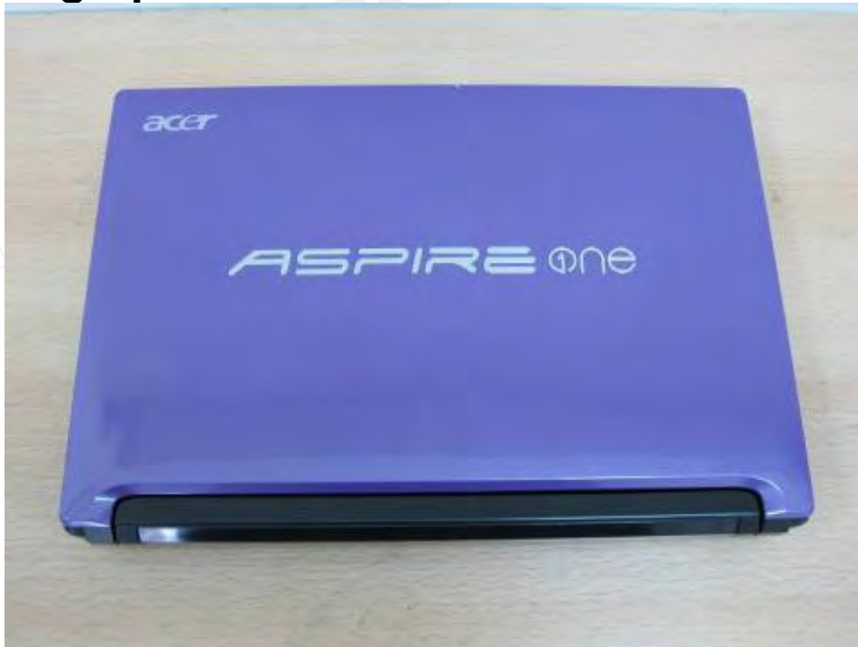
Fig.5 Front view of EUT