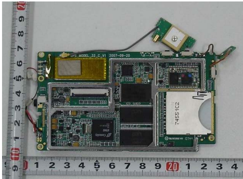
EUT – PCB View