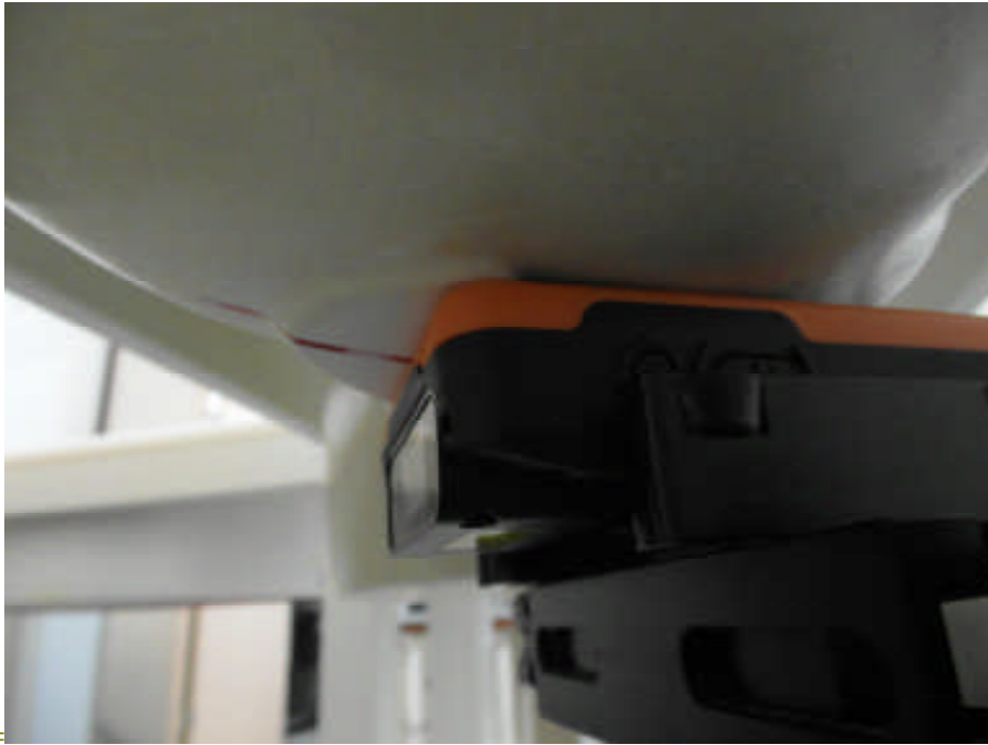
(b) Right Ear Tilt