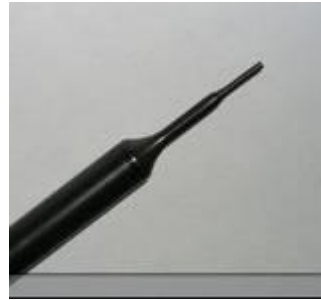
Interior of probe

Application: High precision dosimetric measurements in any exposure scenario (e.g., very strong gradient fields). Only probe which enables compliance testing for frequencies up to 6 GHz with precision of better 30%.