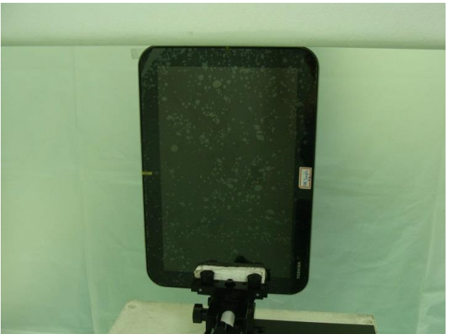
Edge2, Test Separation 0 cm