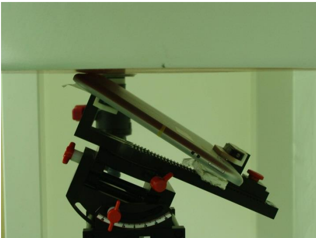
Curved surface of Edge1, Test Separation 0 cm