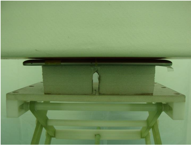
Bottom Face, Test Separation 0 cm