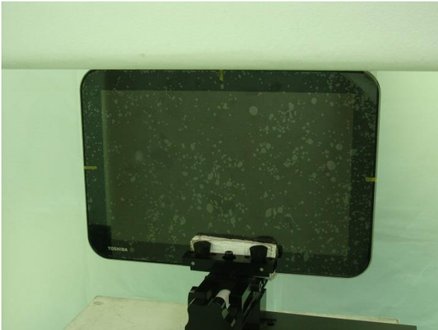
Edge1, Test Separation 0 cm