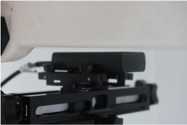
Front at 5 mm