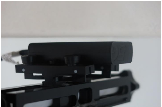
Back at 5 mm