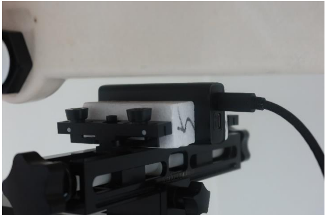
Right Side at 5 mm